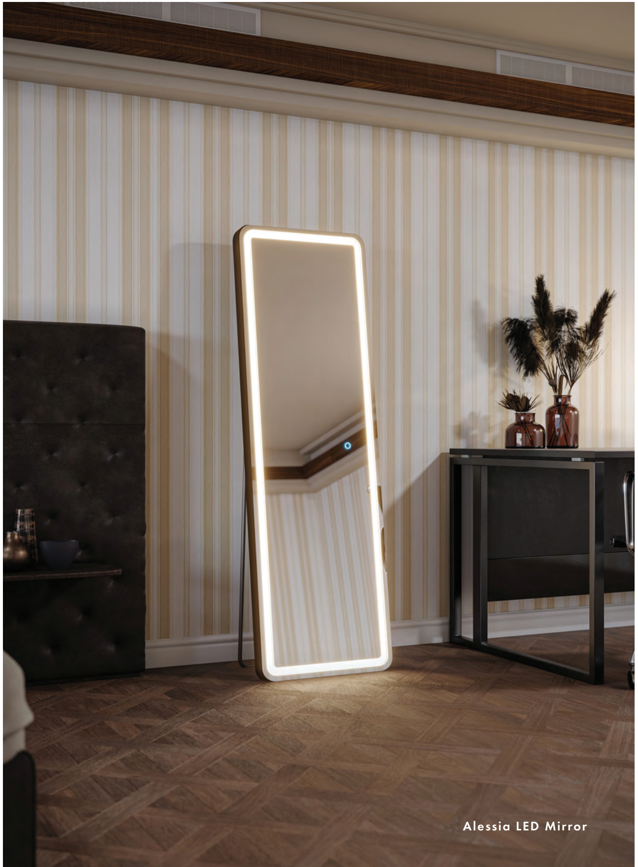
Alessia LED Mirror