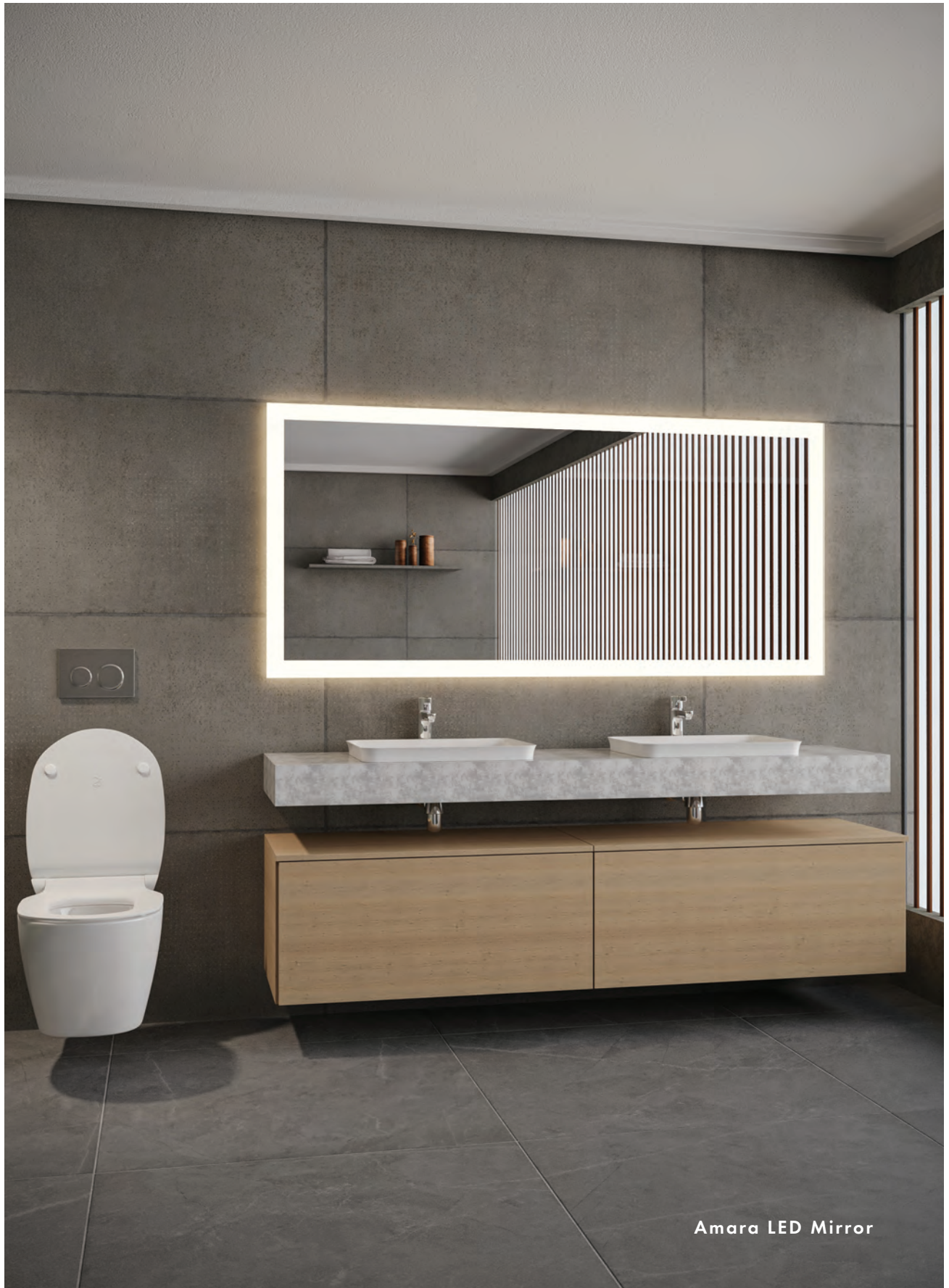
Amara LED Mirror