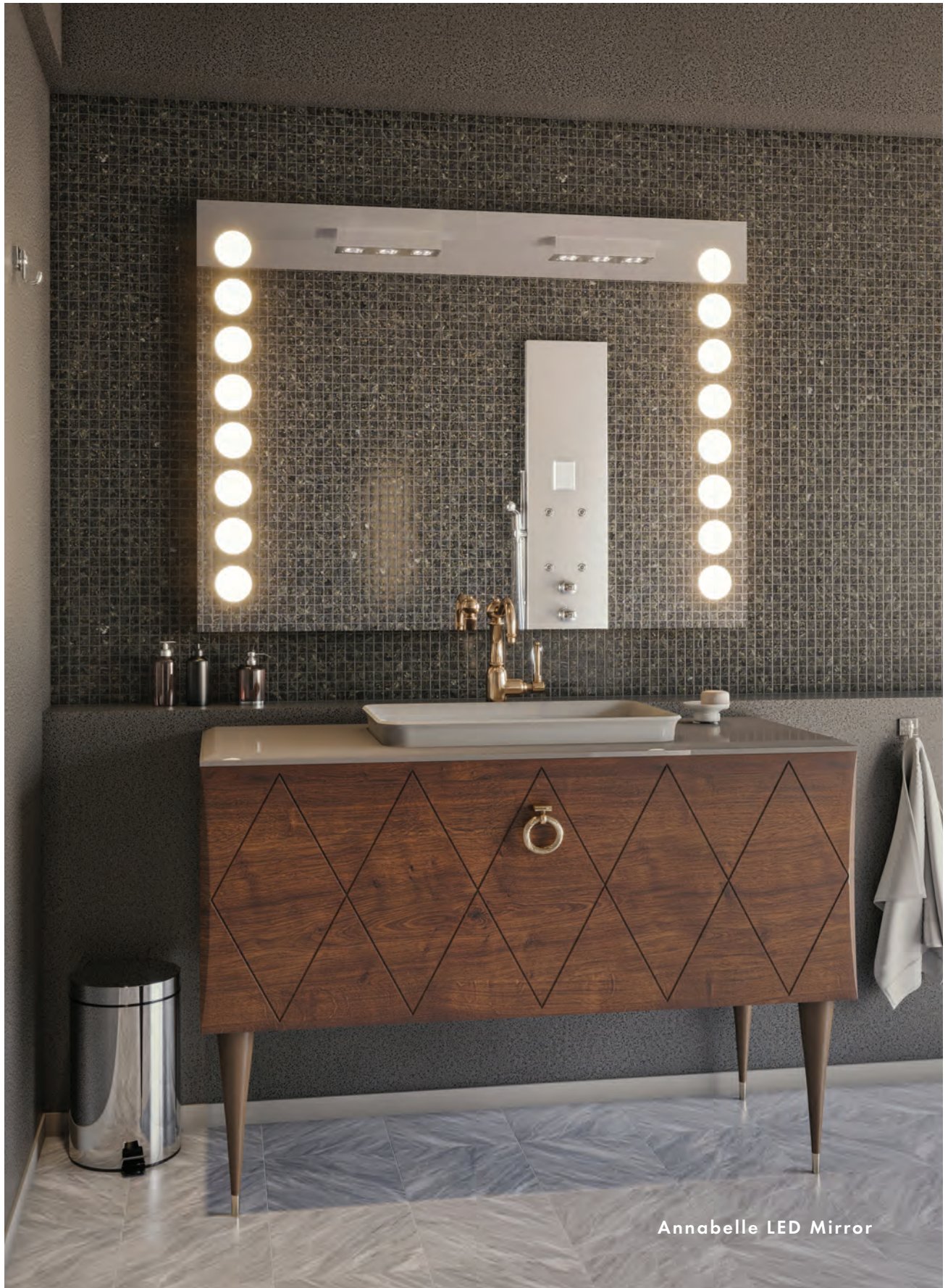
Annabelle LED Mirror