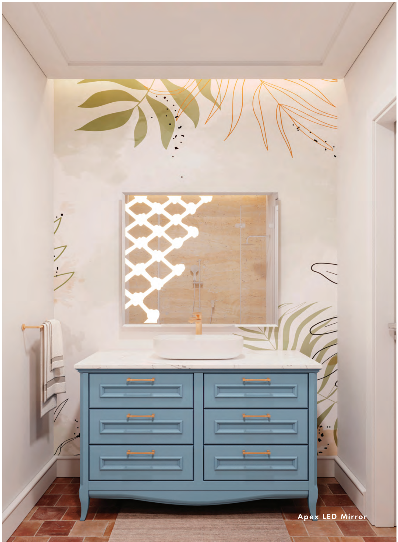
Apex LED Mirror