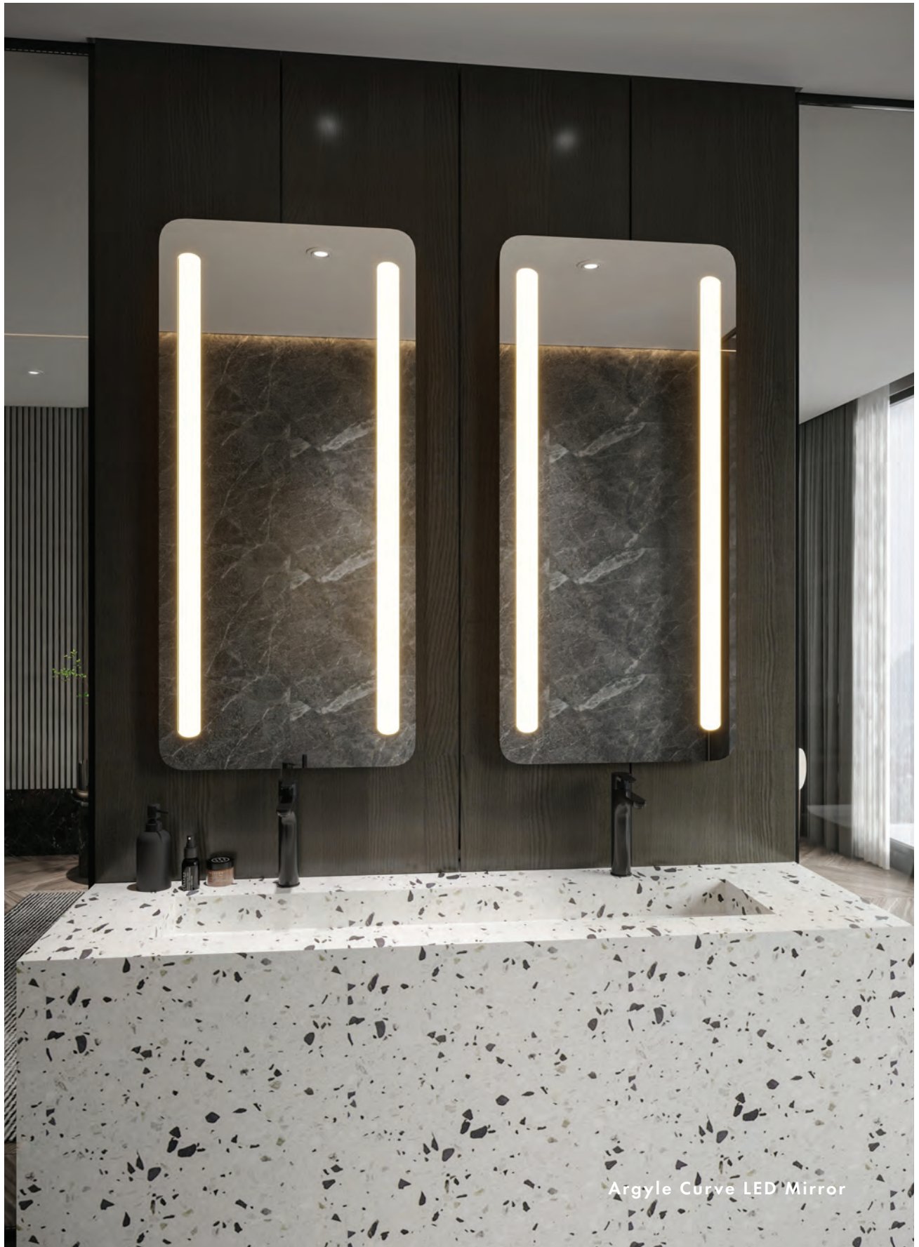
Argyle Curve LED Mirror