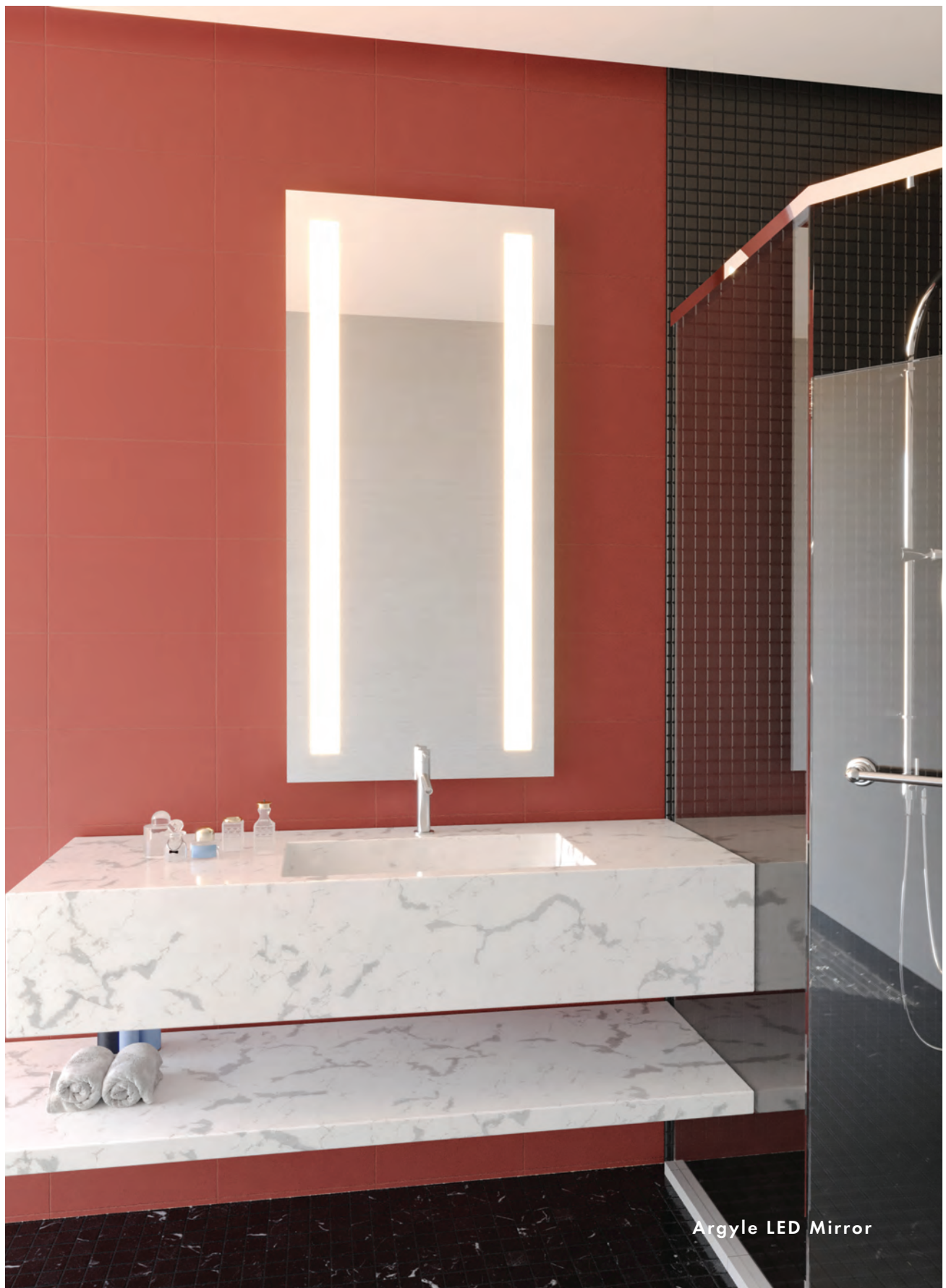
Argyle LED Mirror