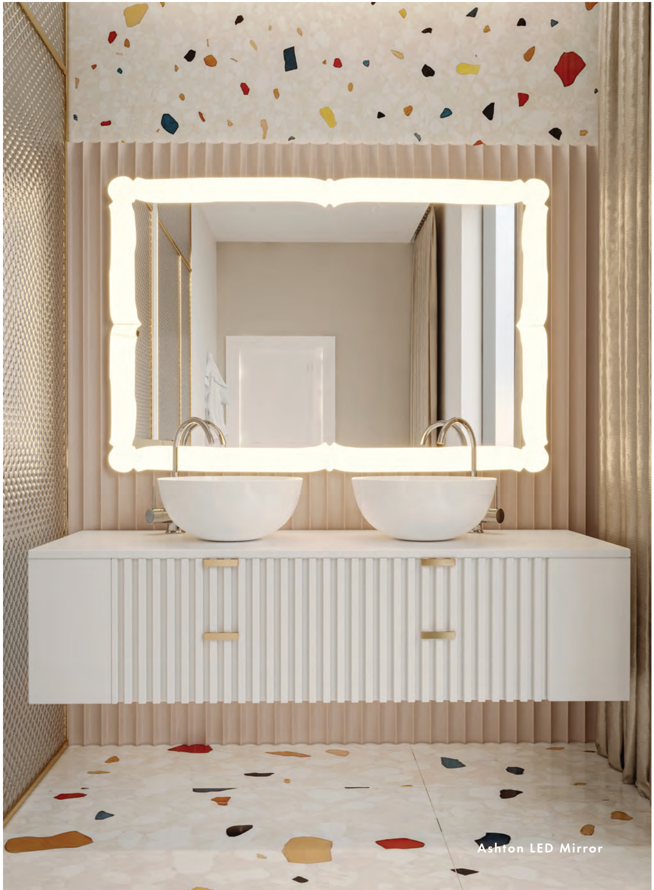
Ashton LED Mirror