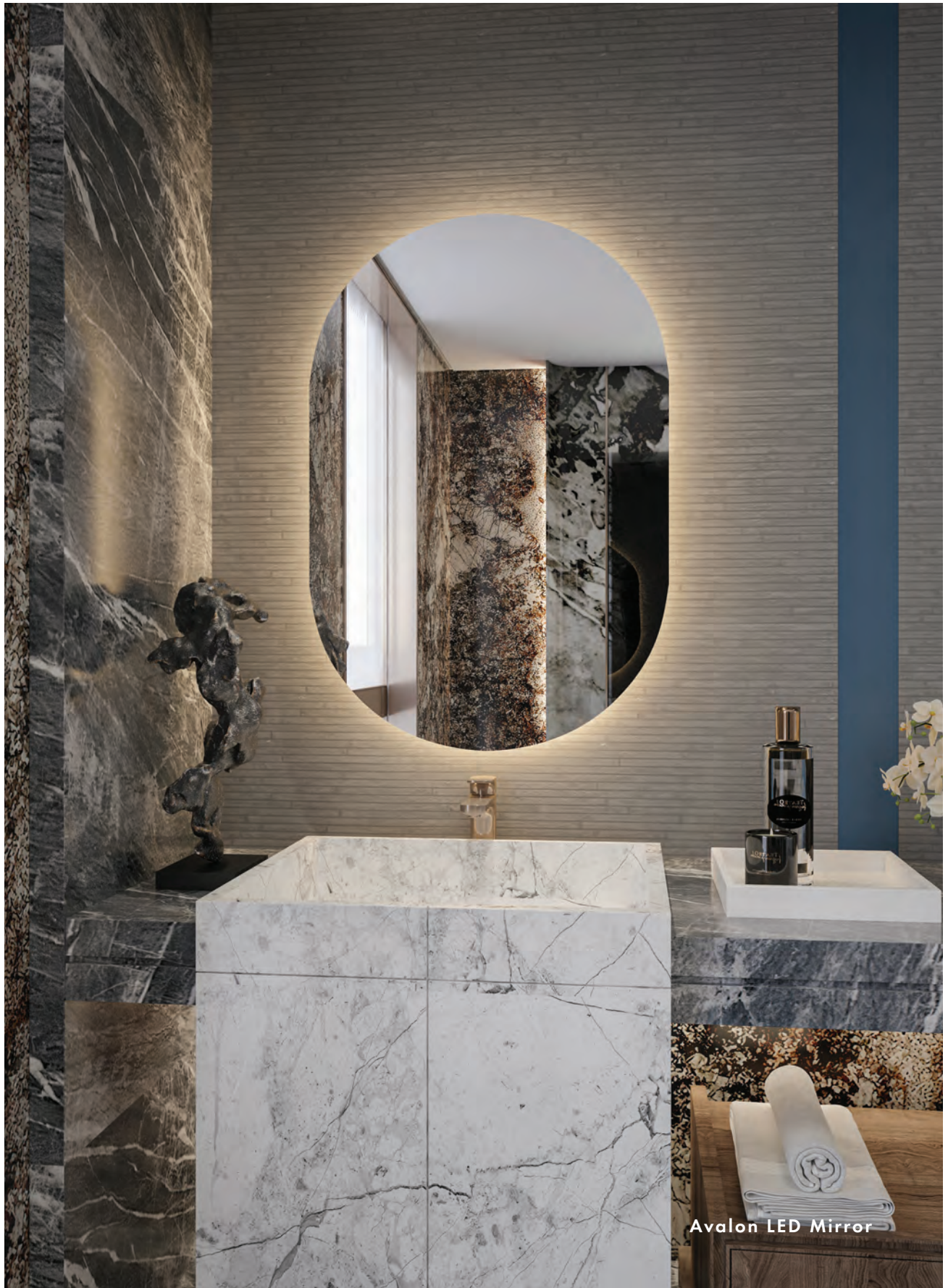
Avalon LED Mirror