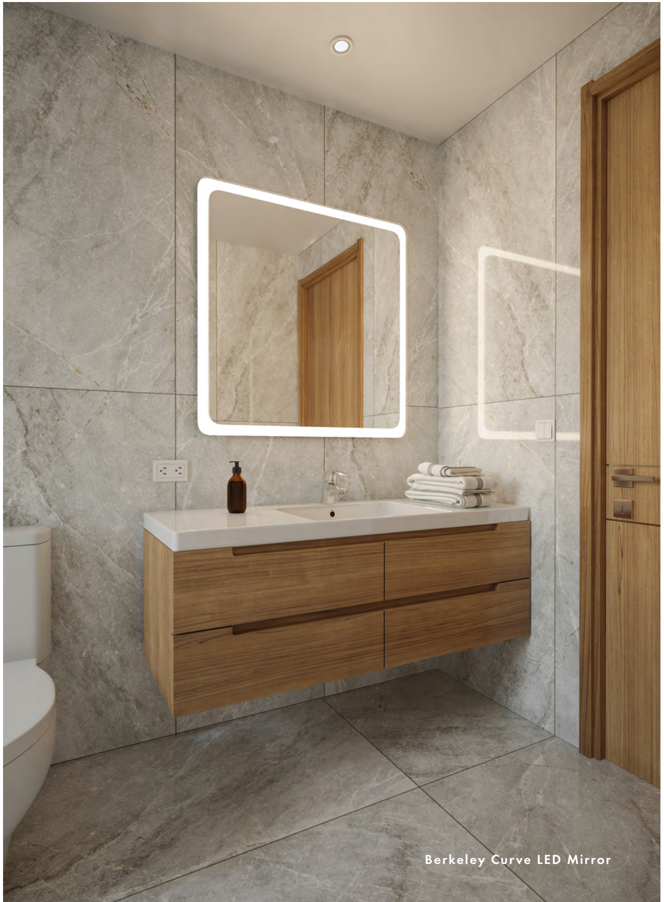
Berkeley Curve LED Mirror