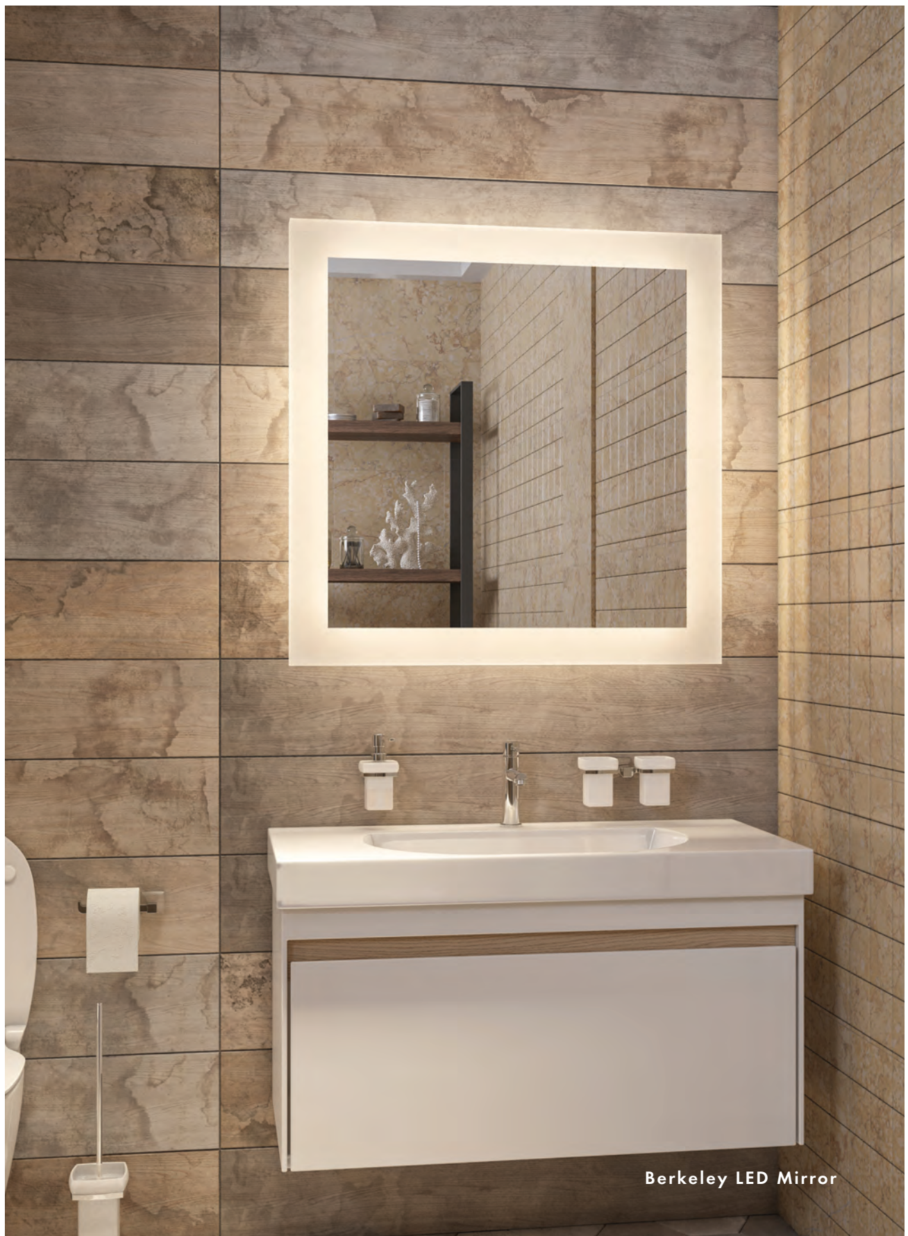
Berkeley LED Mirror