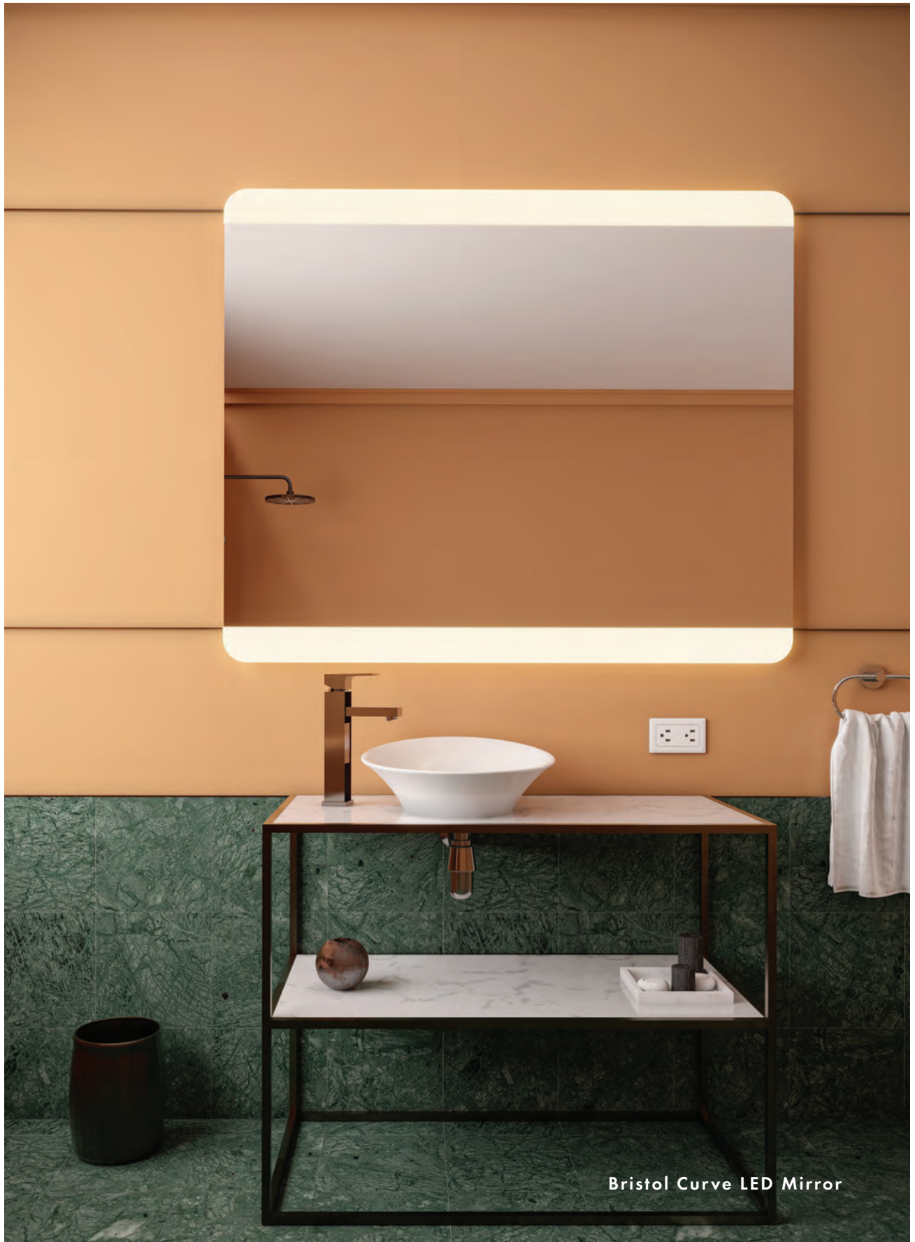
Bristol Curve LED Mirror