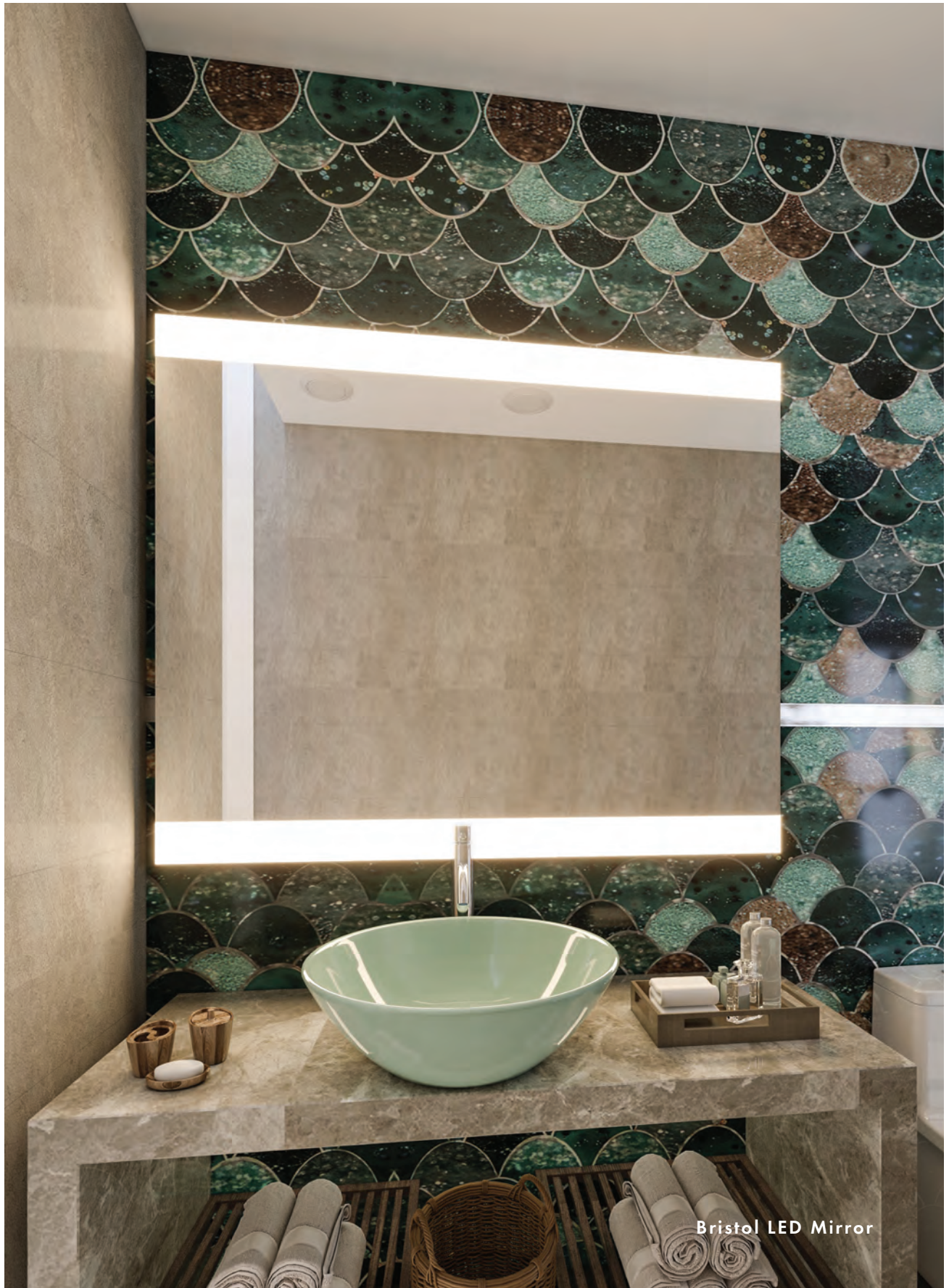
Bristol LED Mirror