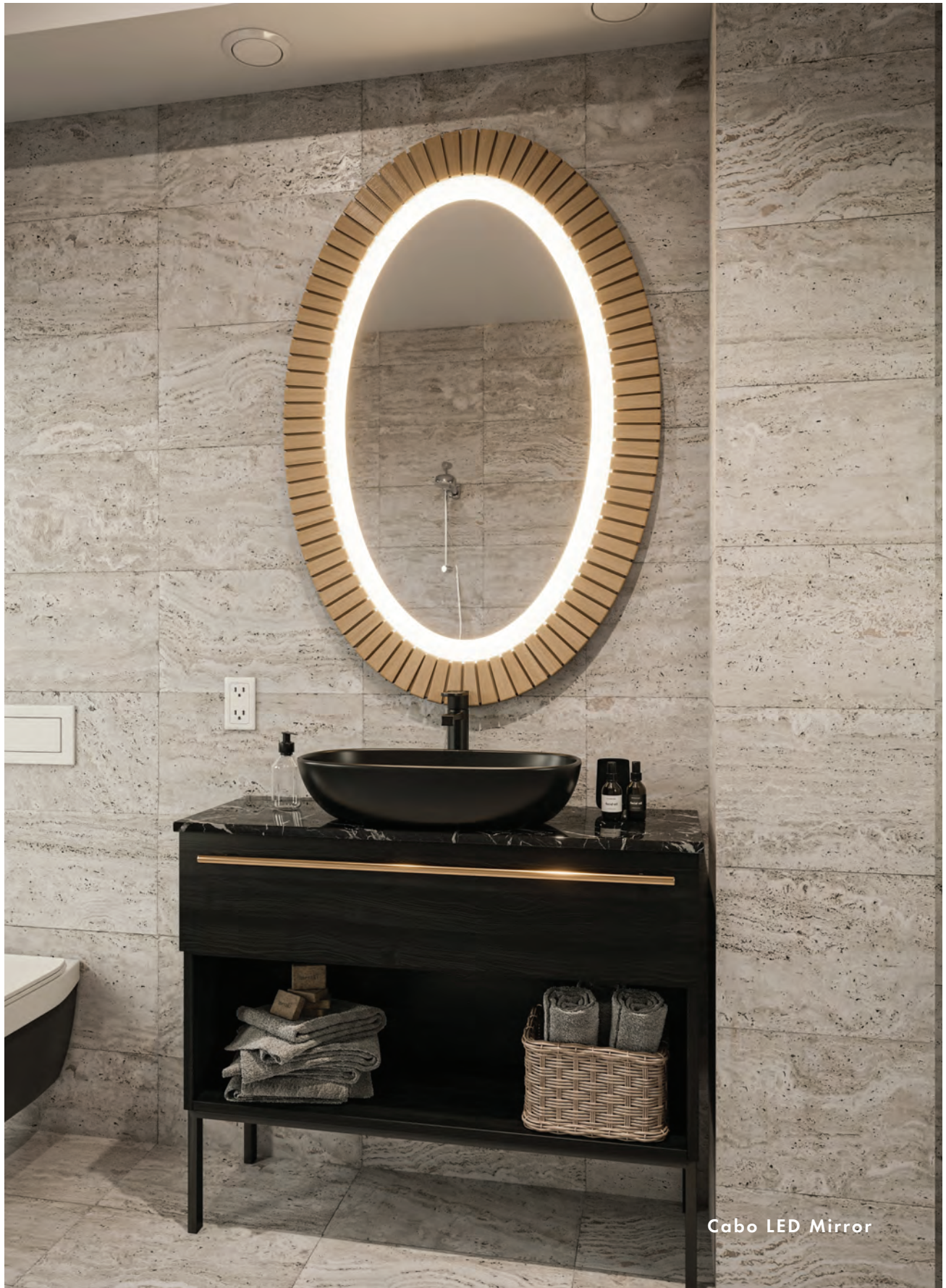
Cabo LED Mirror