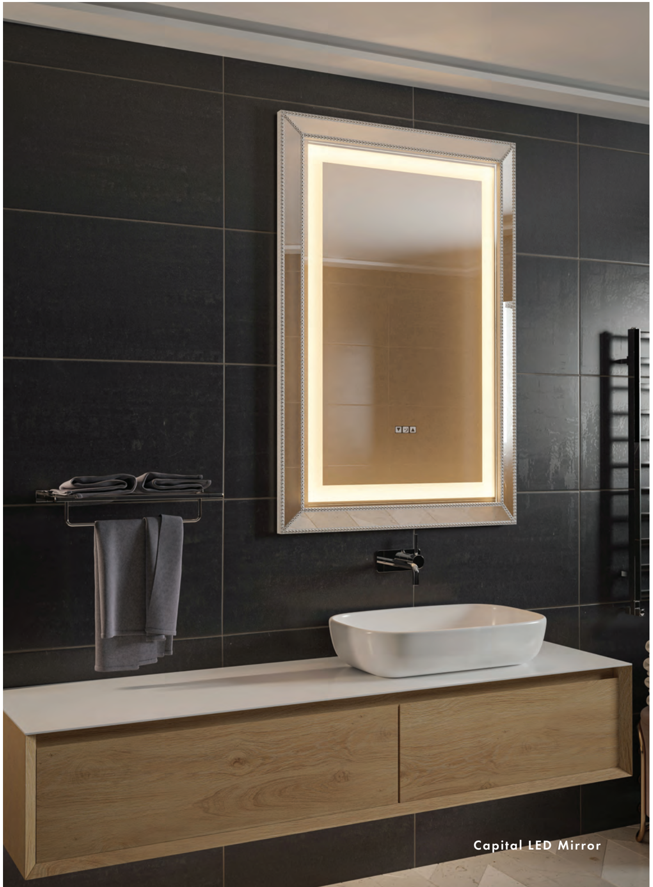
Capital LED Mirror