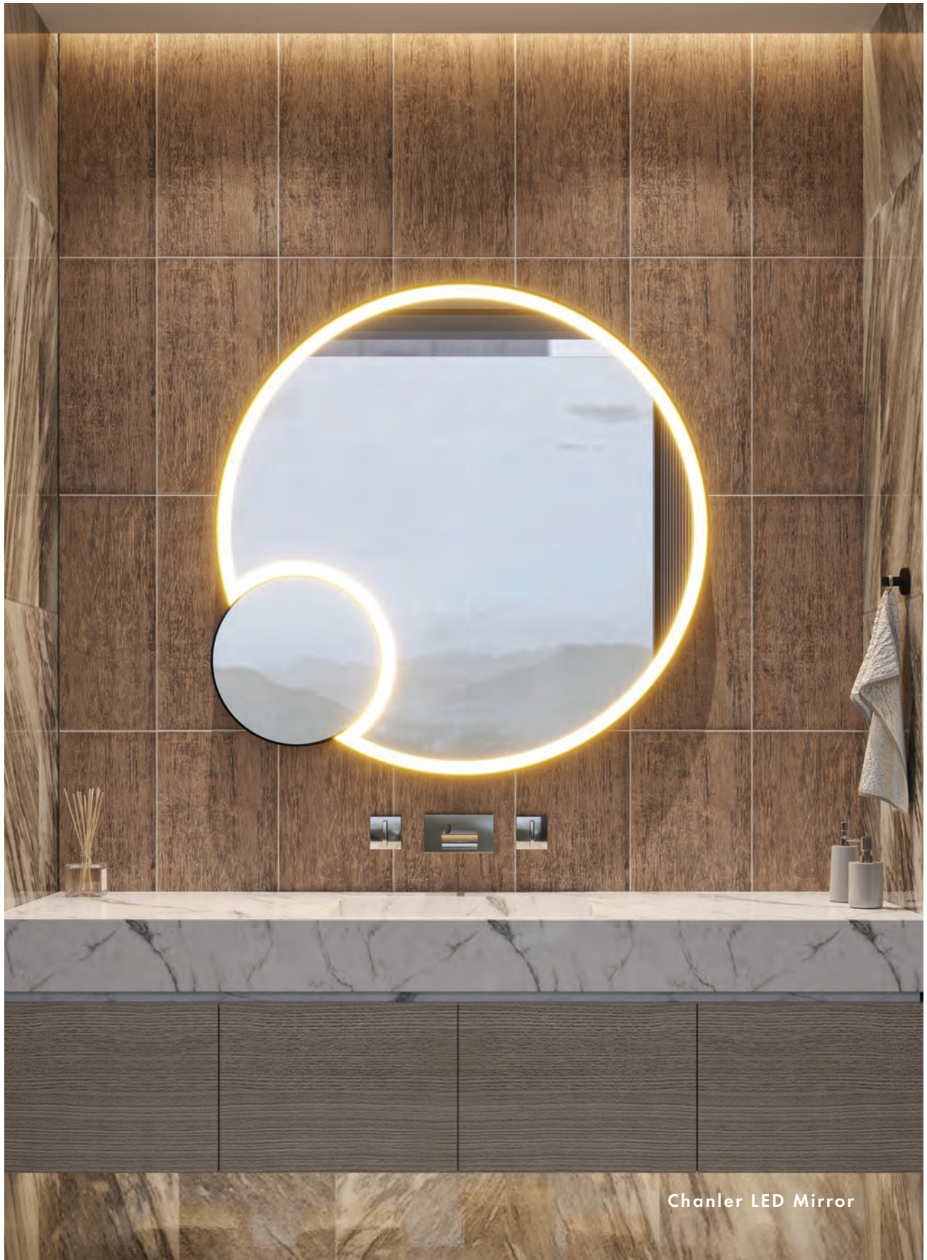
Chanler LED Mirror