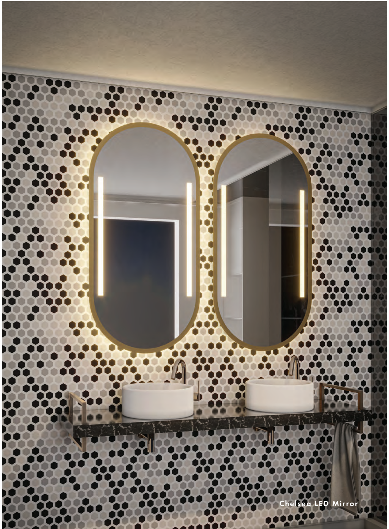
Chelsea LED Mirror