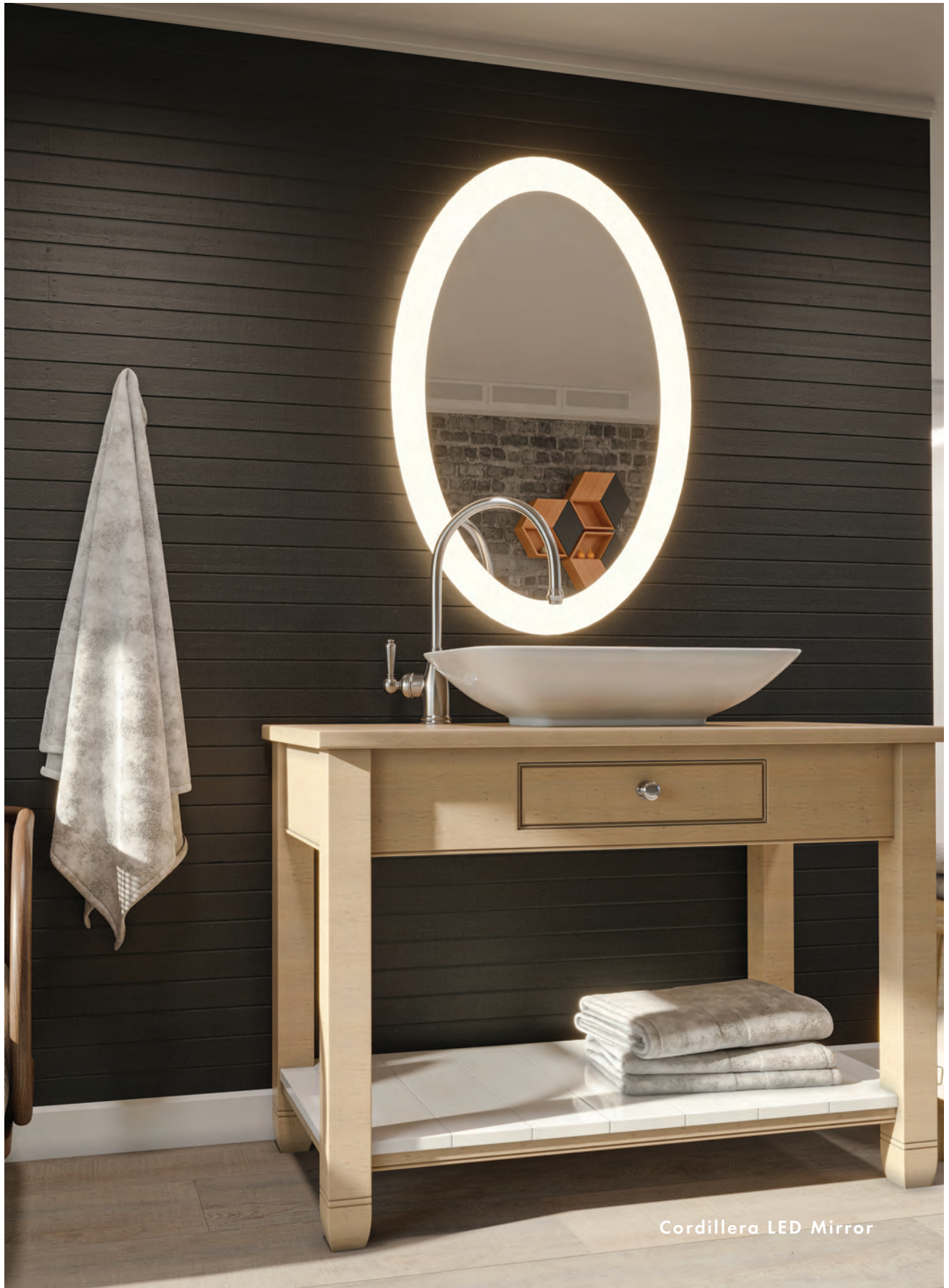
Cordillera LED Mirror