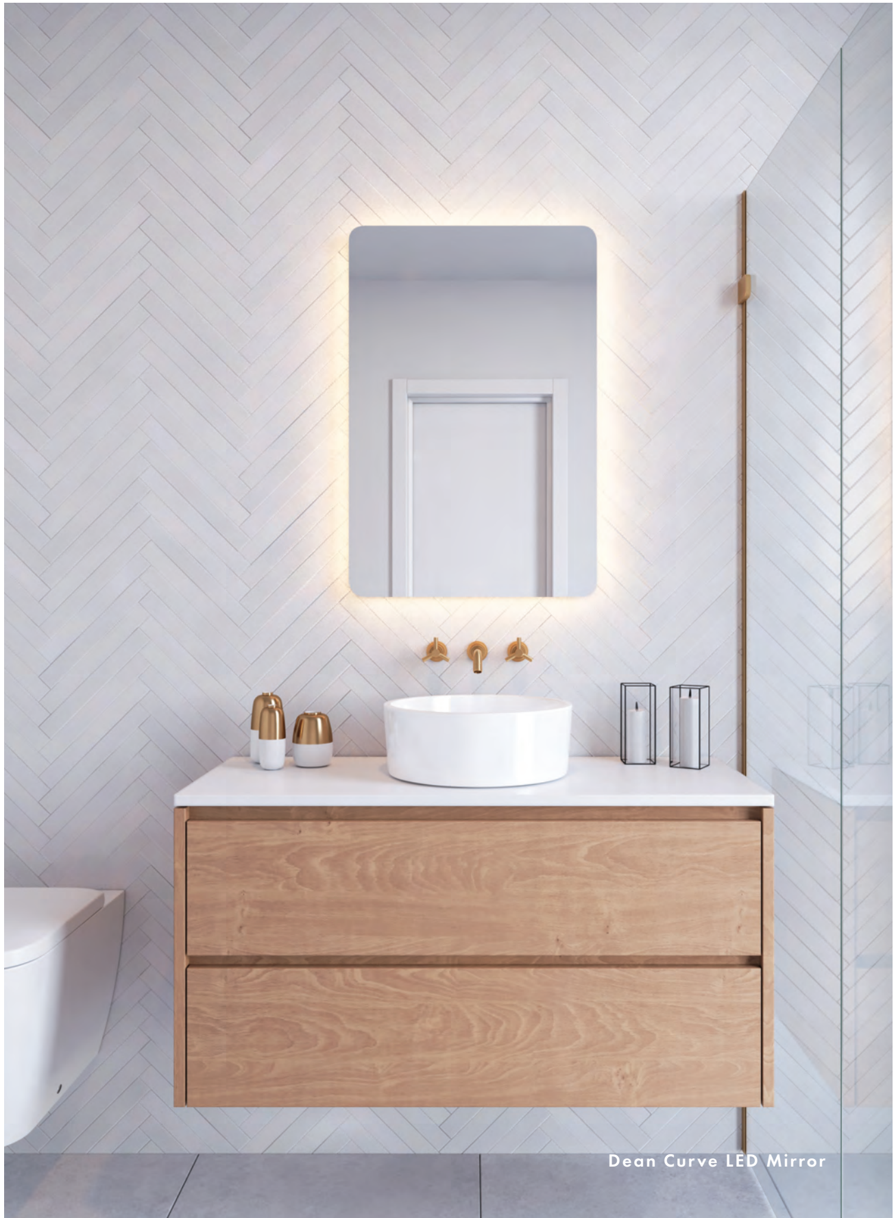
Dean Curve LED Mirror