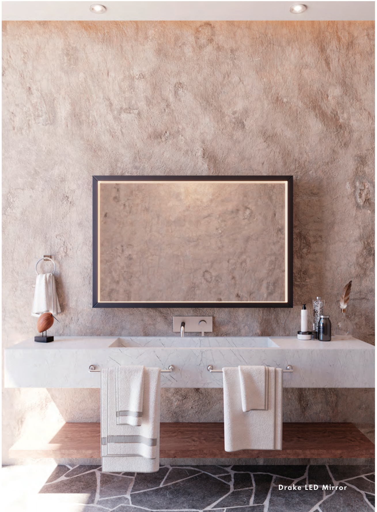
Drake LED Mirror