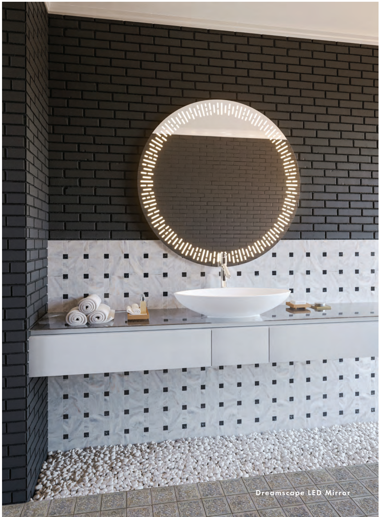
Dreamscape LED Mirror