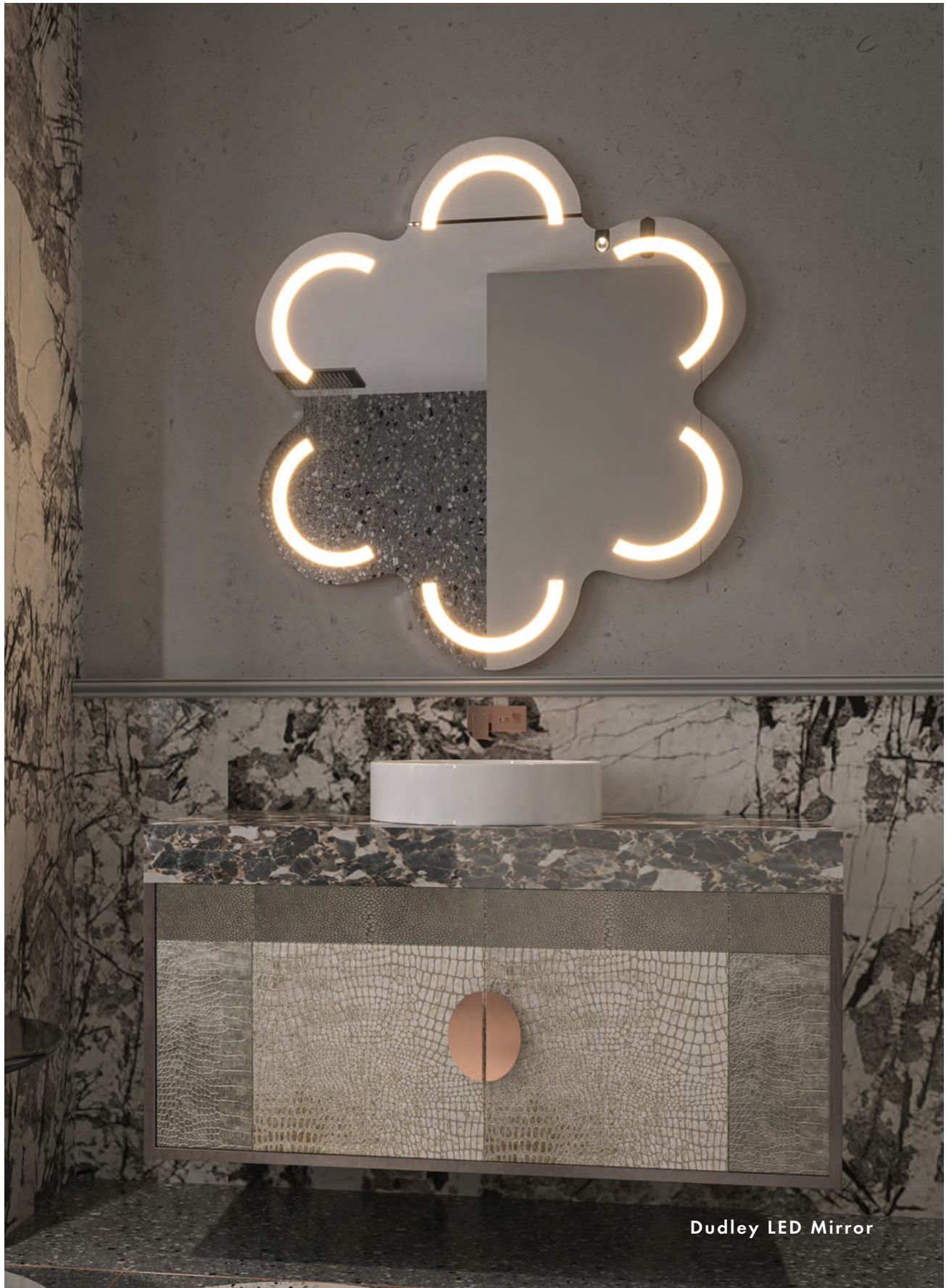
Dudley LED Mirror