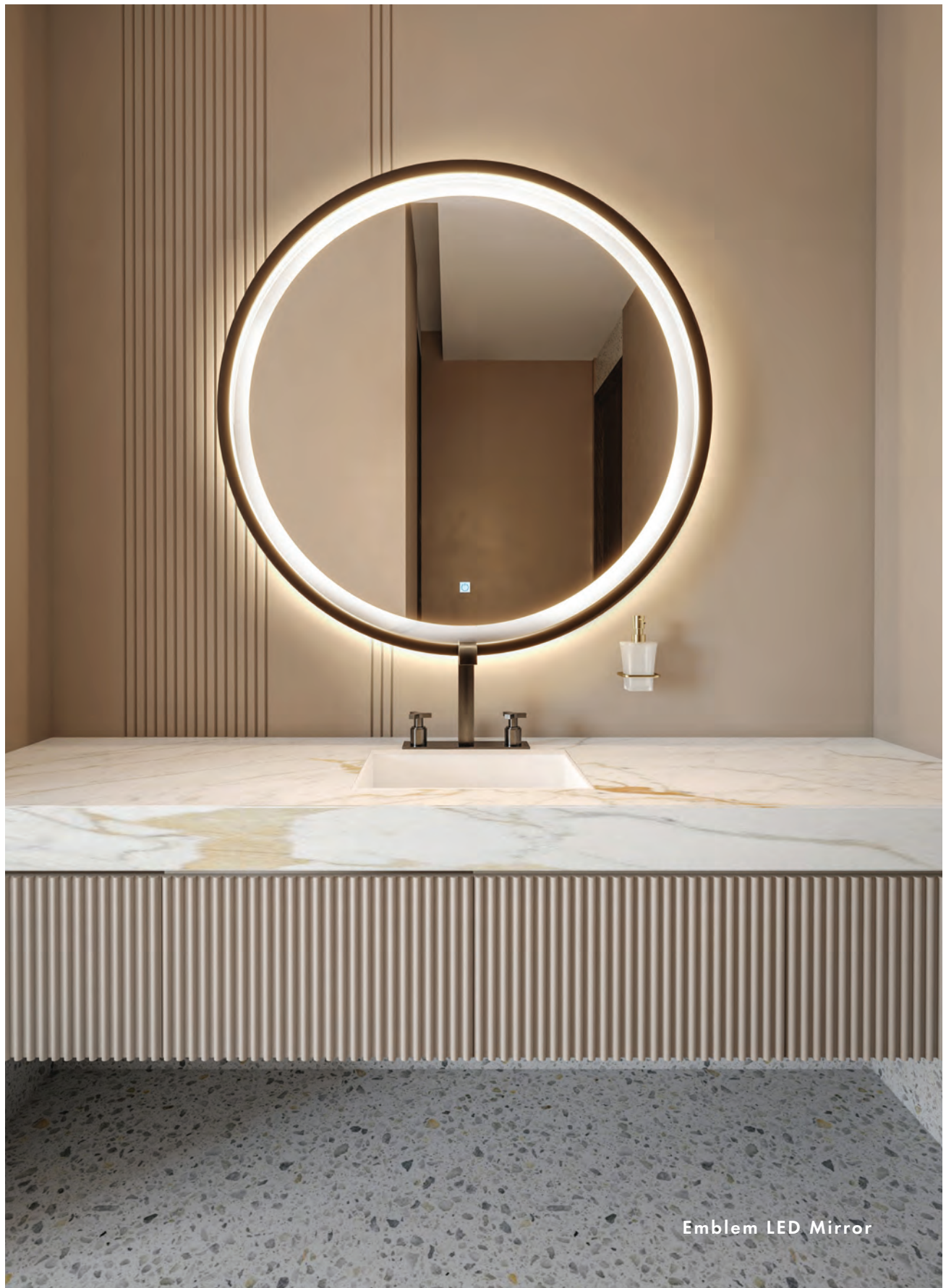
Emblem LED Mirror