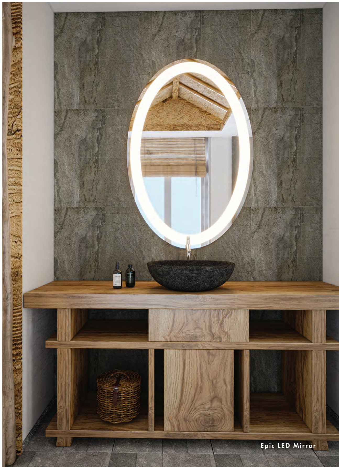
Epic LED Mirror