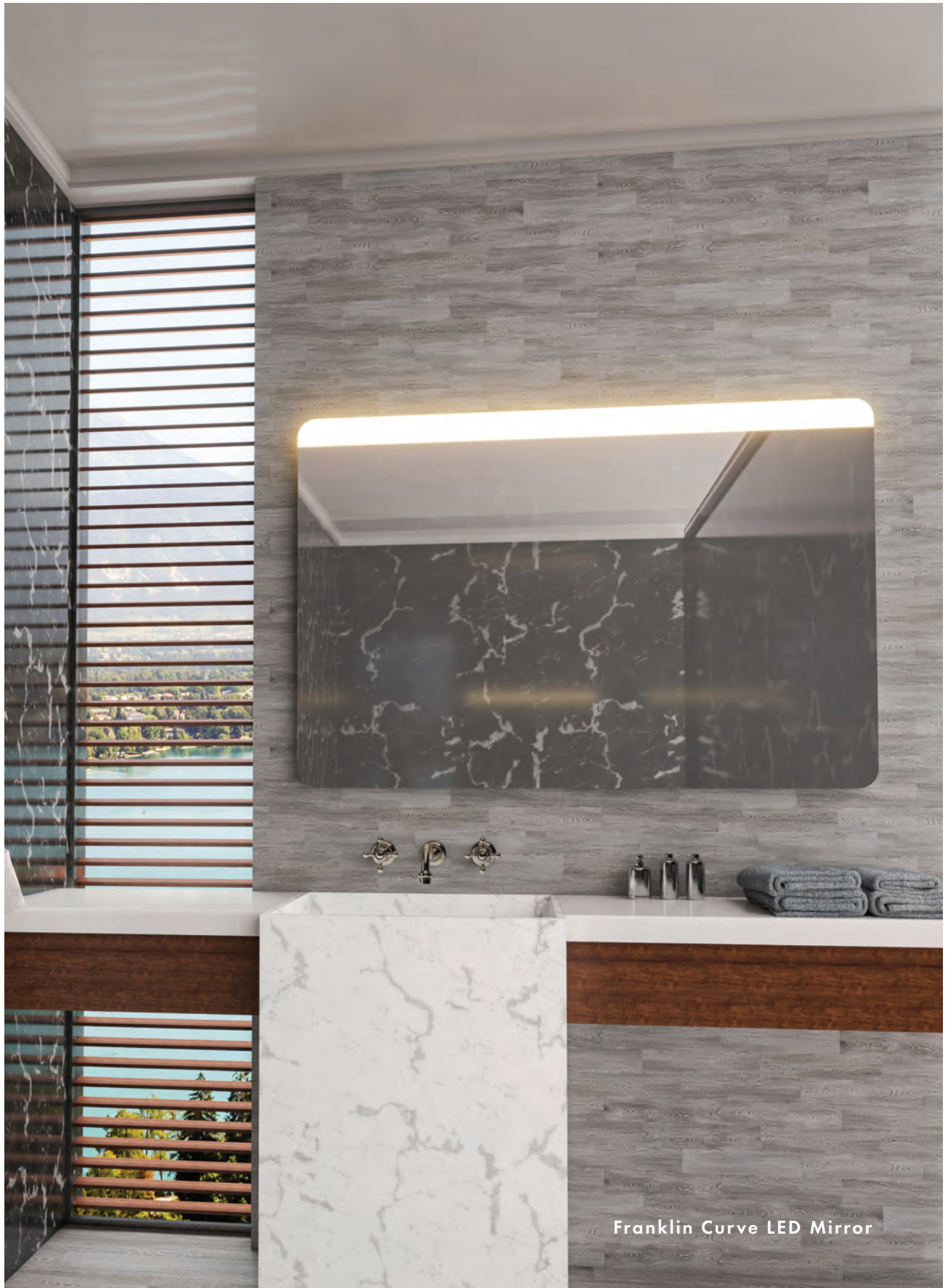
Franklin Curve LED Mirror