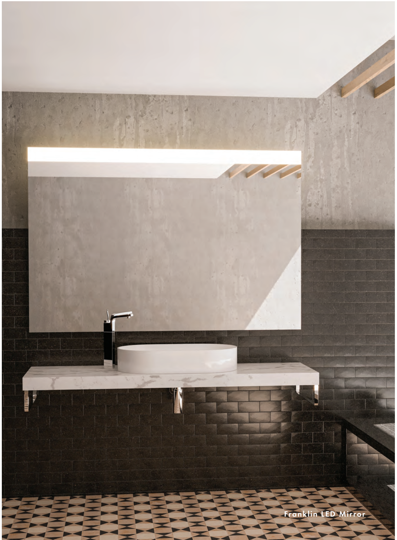
Franklin LED Mirror