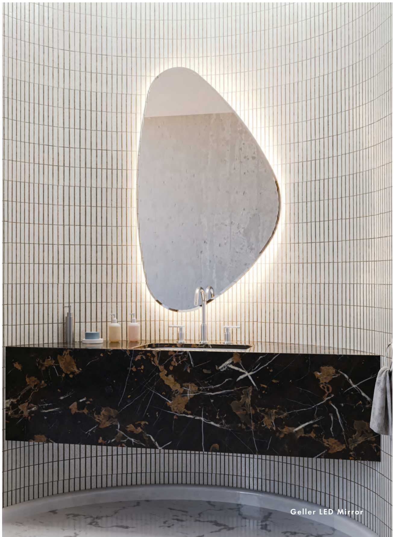
Geller LED Mirror