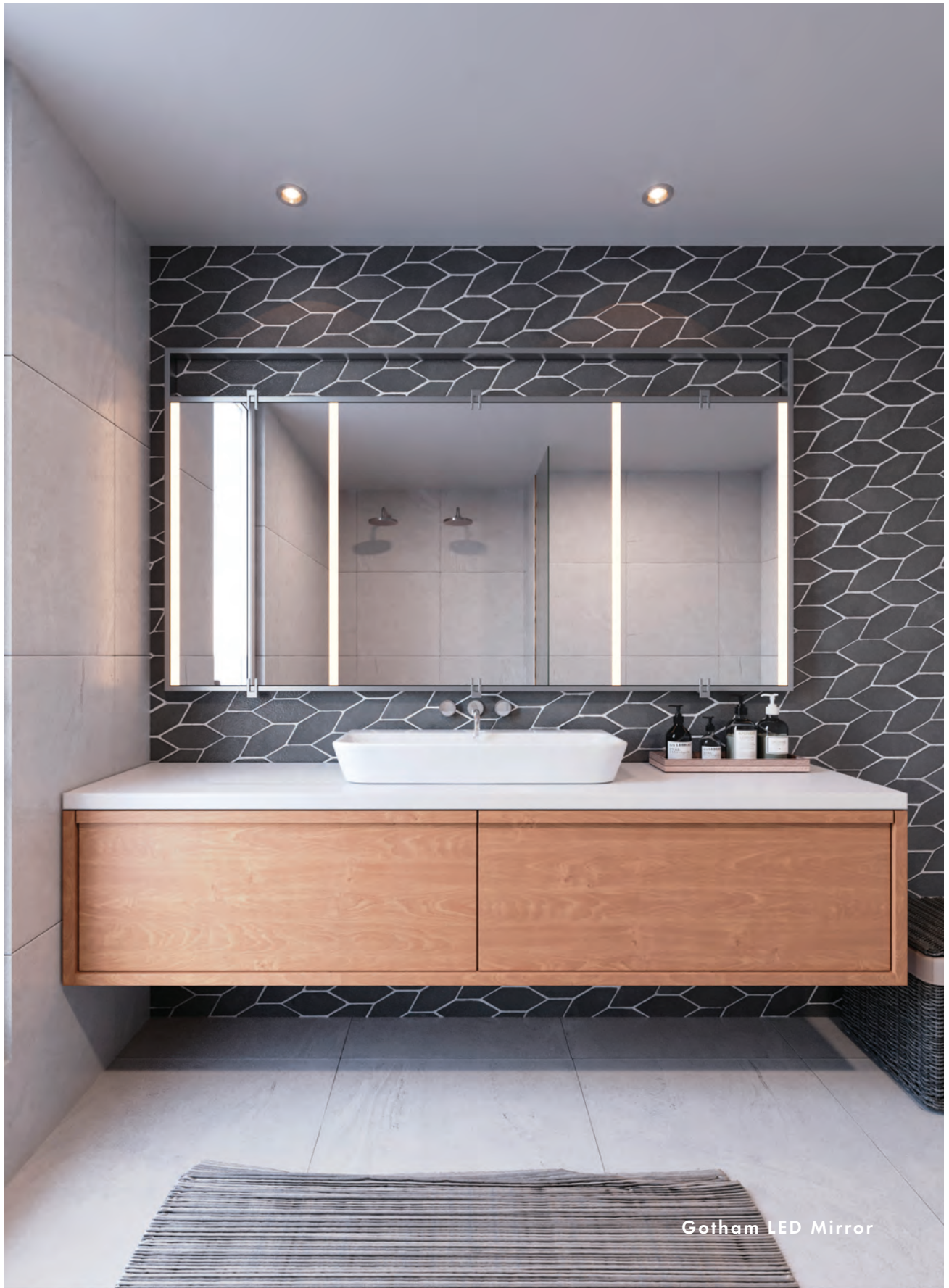
Gotham LED Mirror