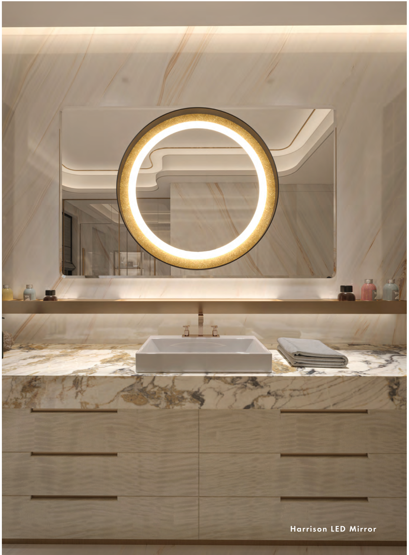
Harrison LED Mirror