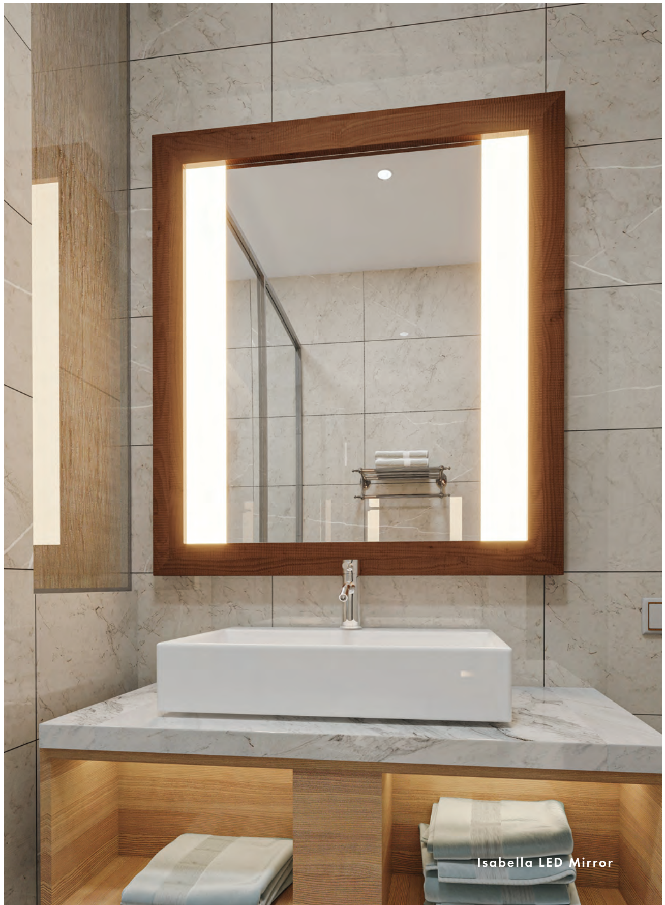
Isabella LED Mirror