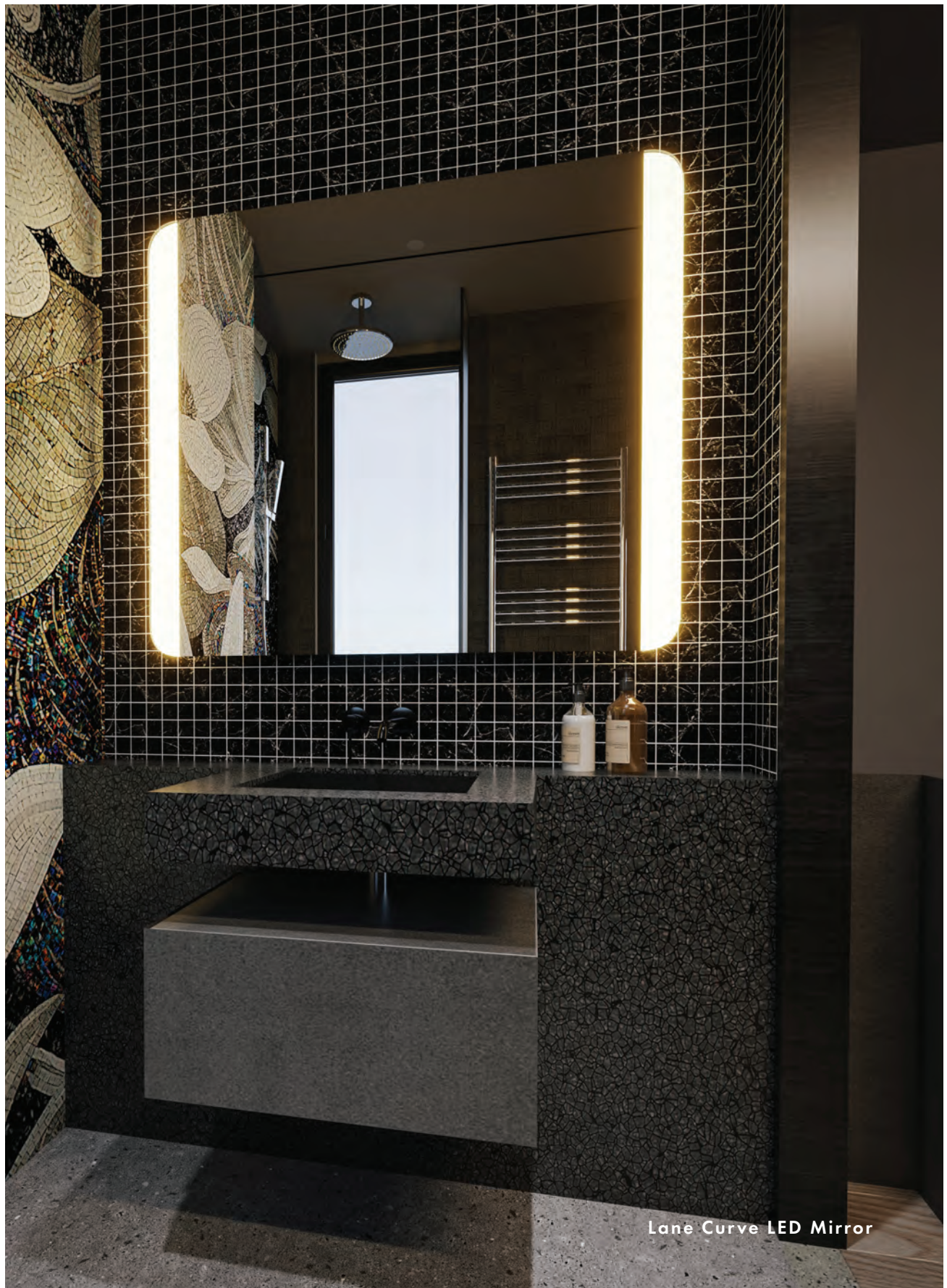
Lane Curve LED Mirror