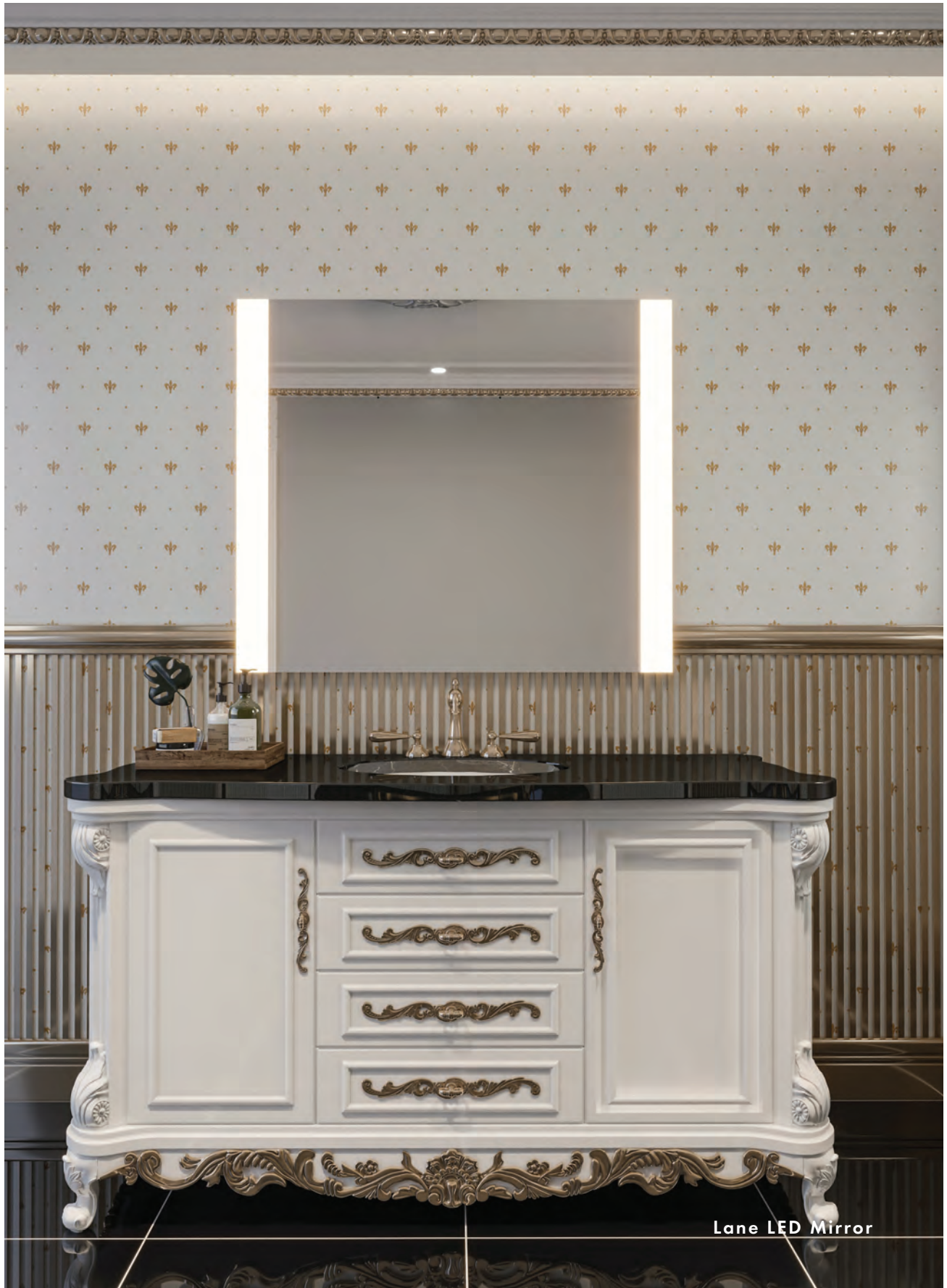
Lane LED Mirror