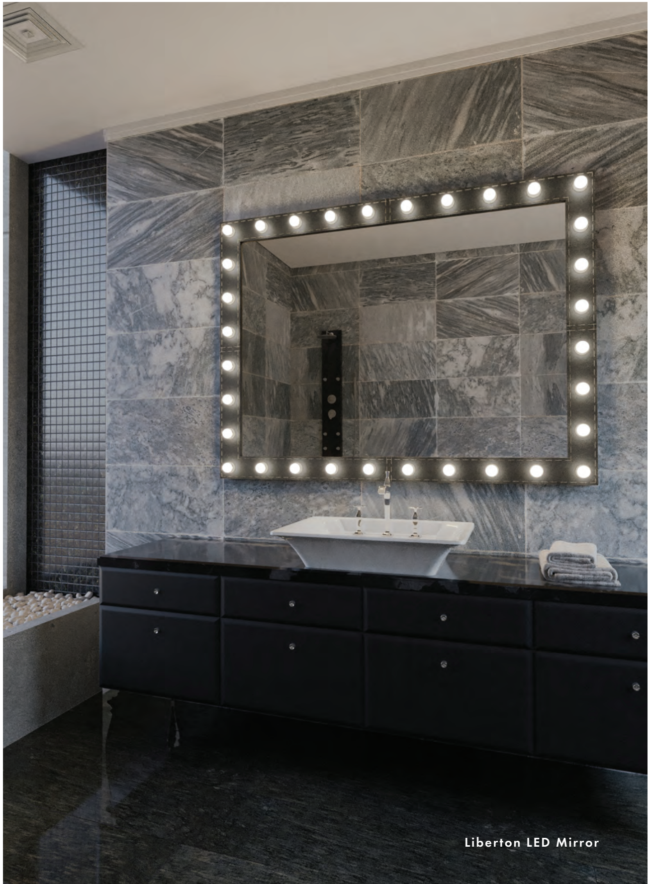
Liberton LED Mirror