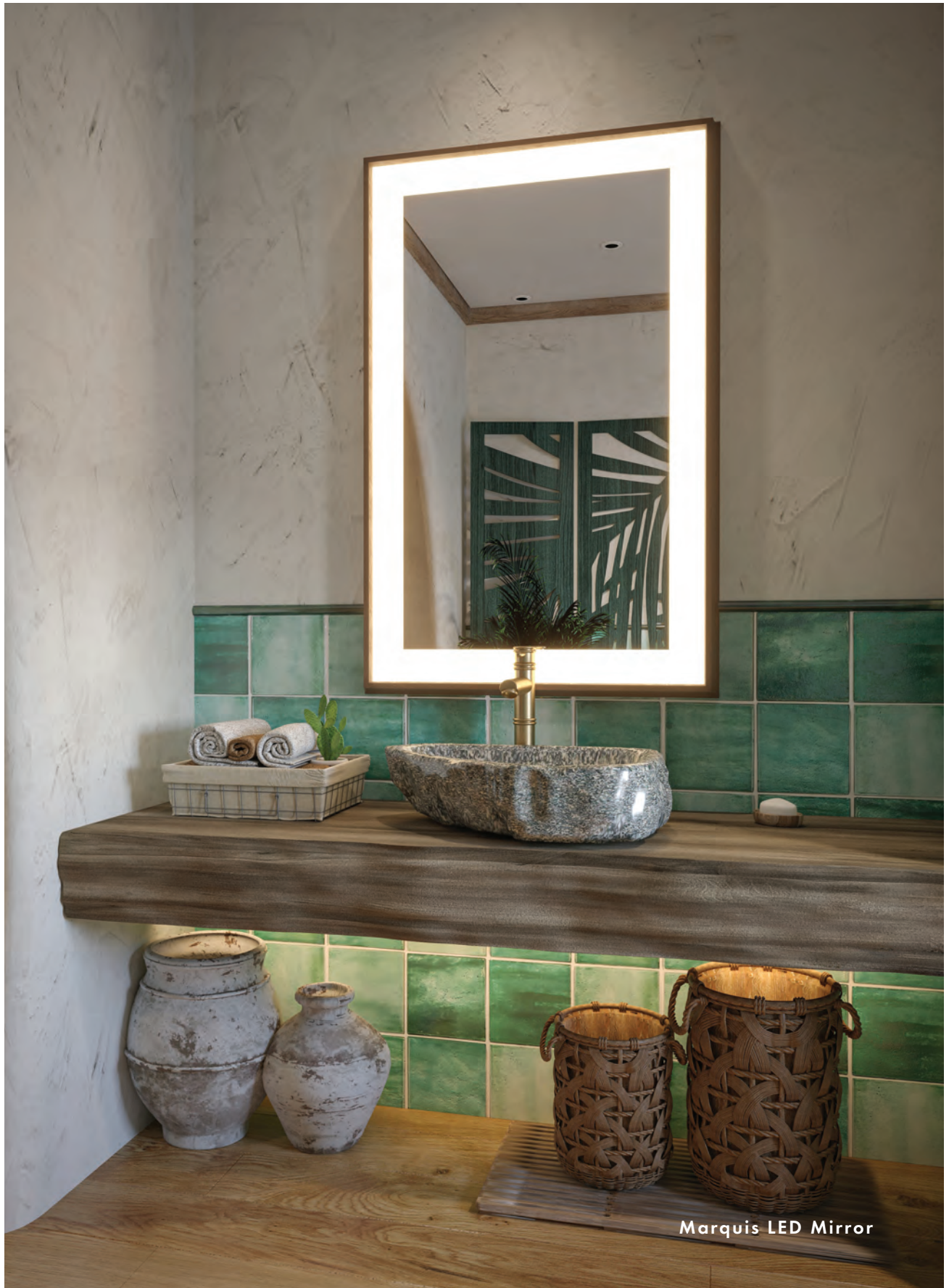
Marquis LED Mirror