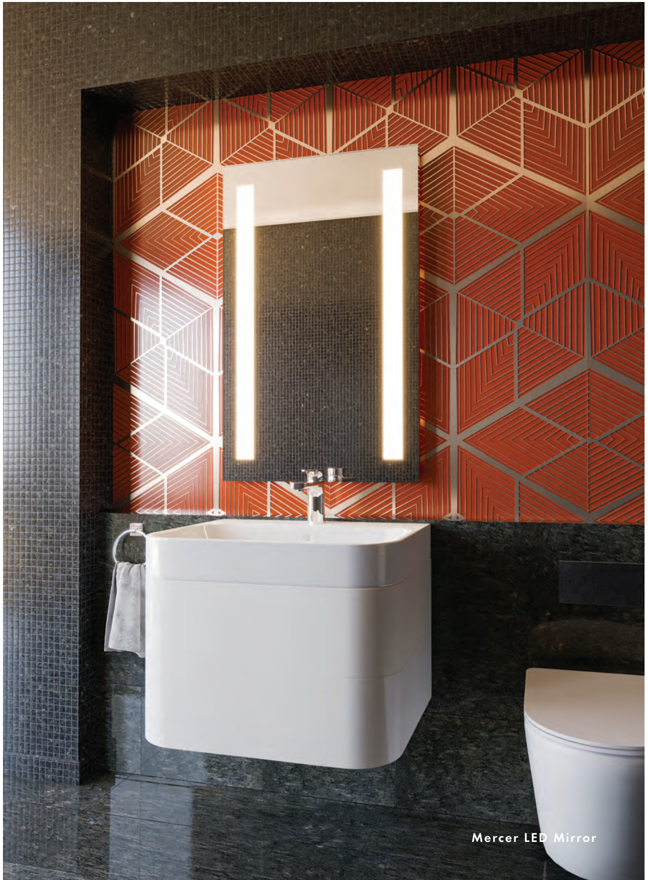
Mercer LED Mirror