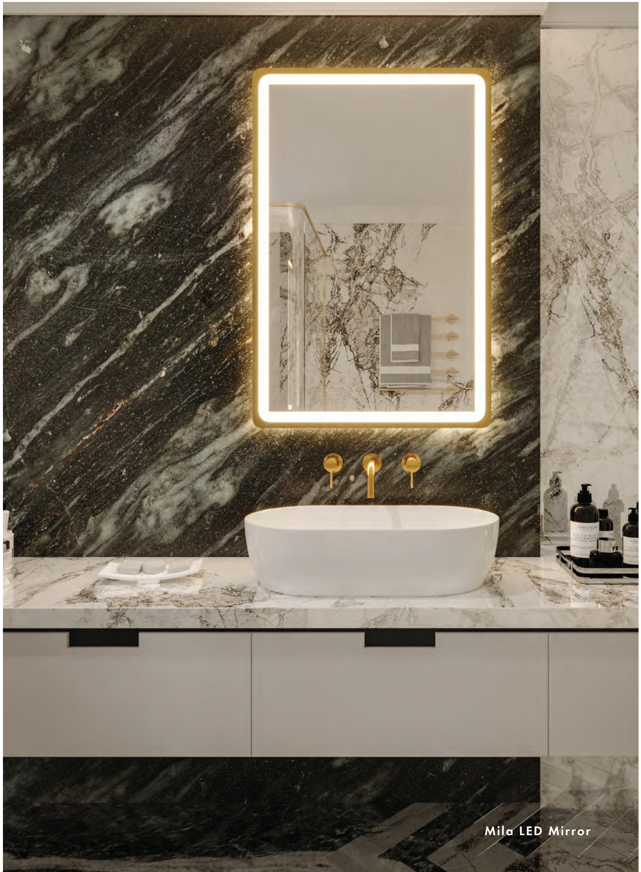
Mila LED Mirror