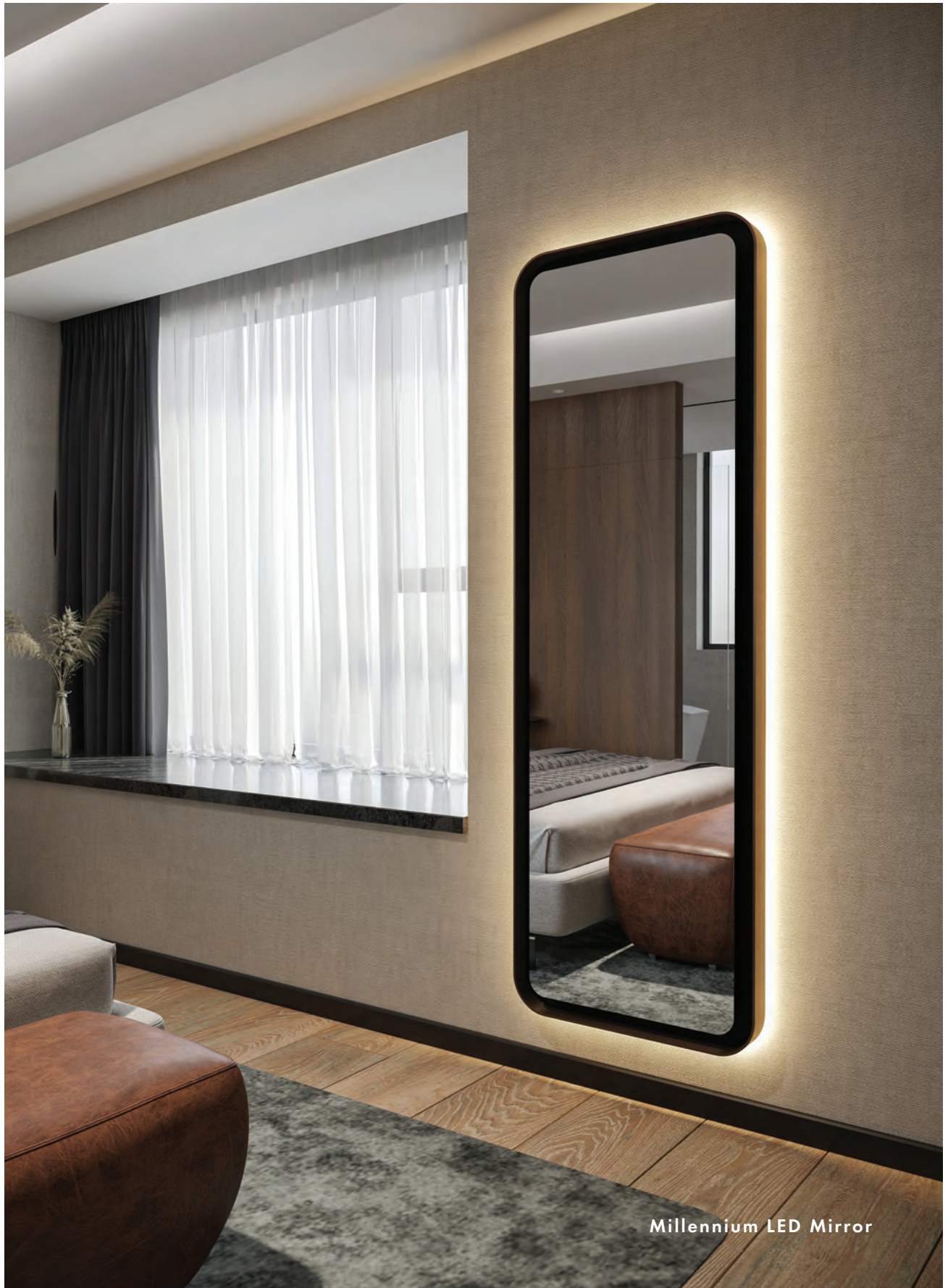
Millennium LED Mirror