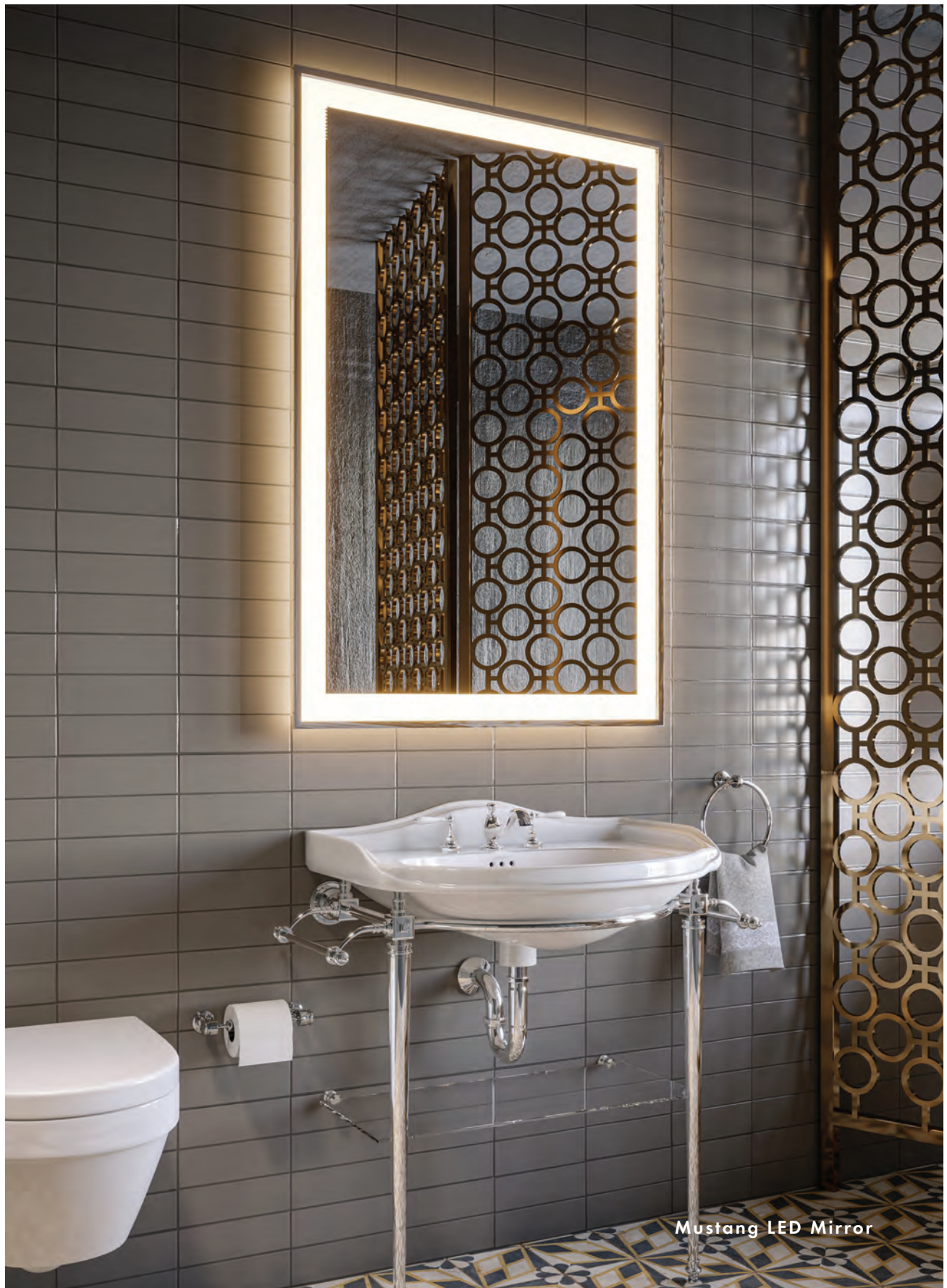
Mustang LED Mirror