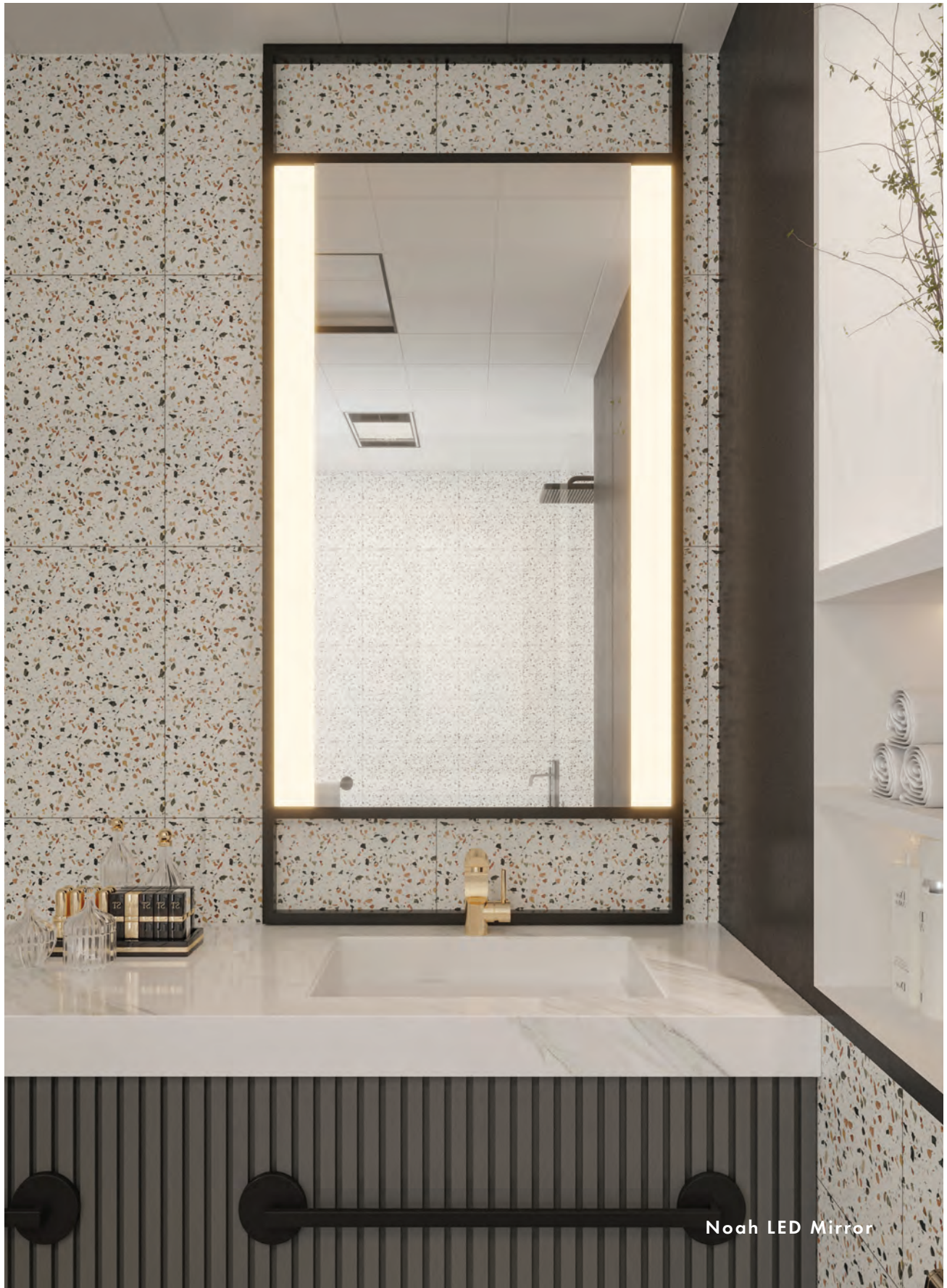
Noah LED Mirror