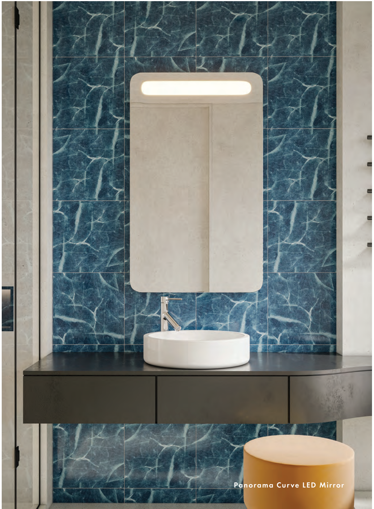
Panorama Curve LED Mirror