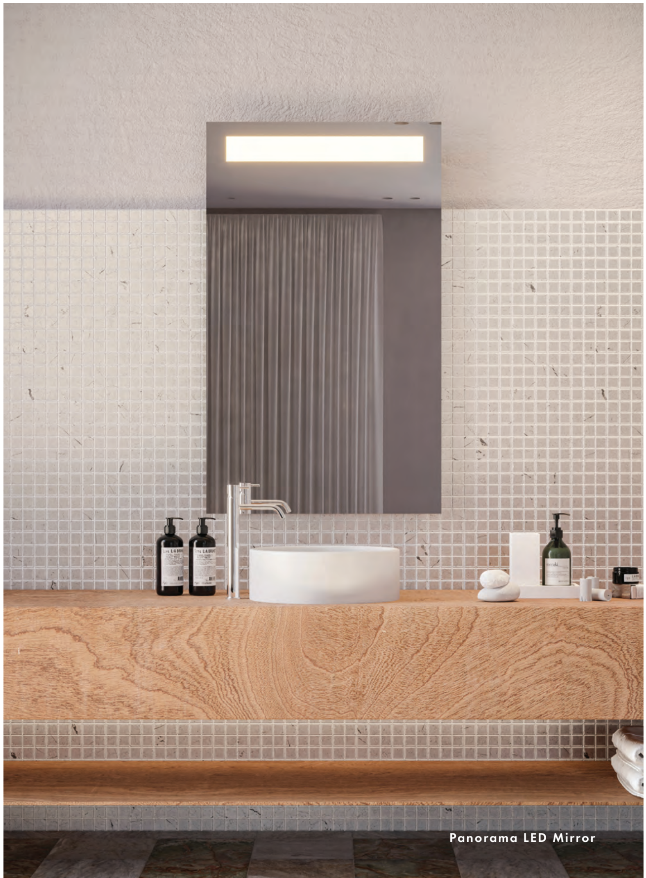
Panorama LED Mirror