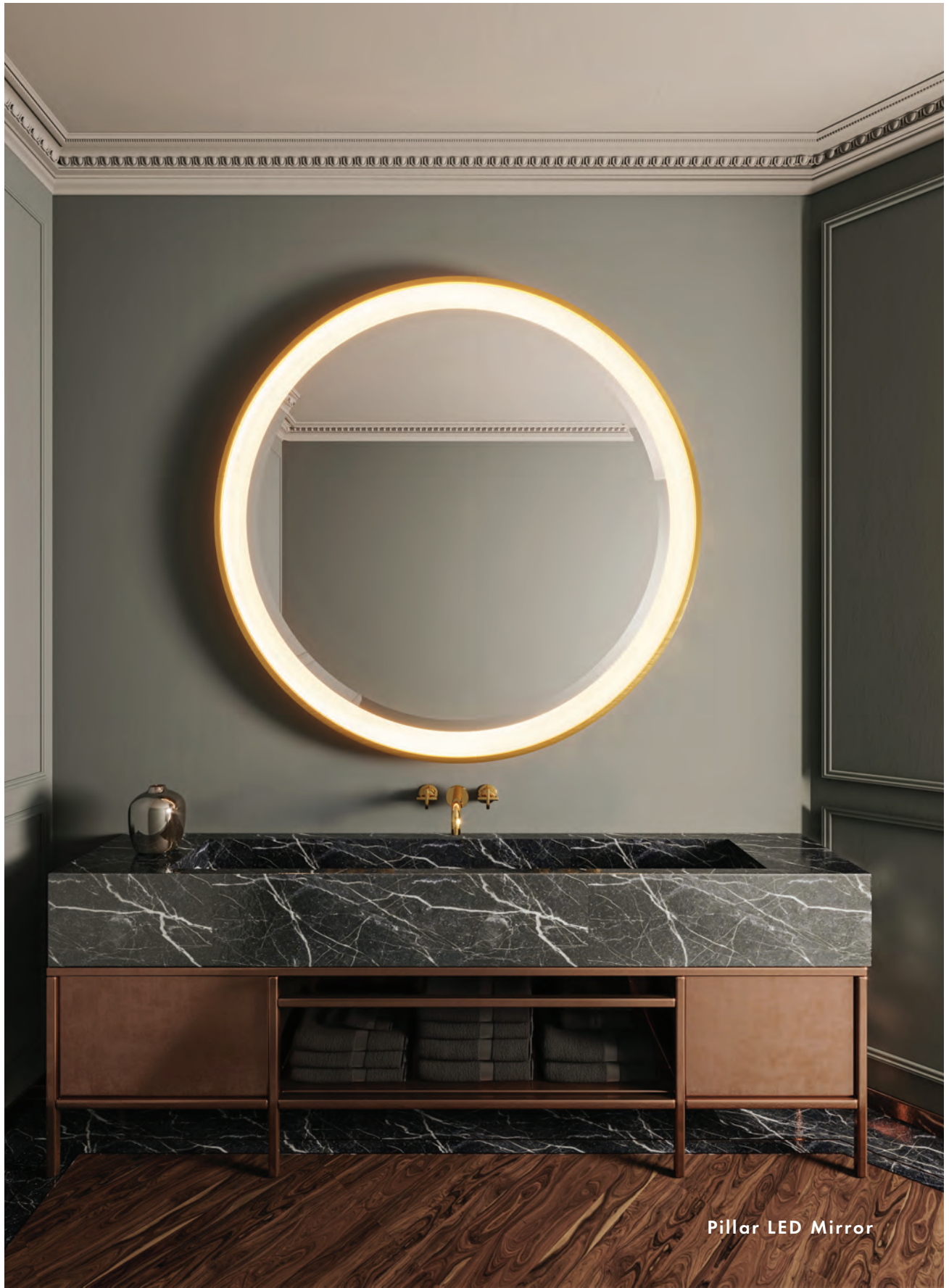
Pillar LED Mirror