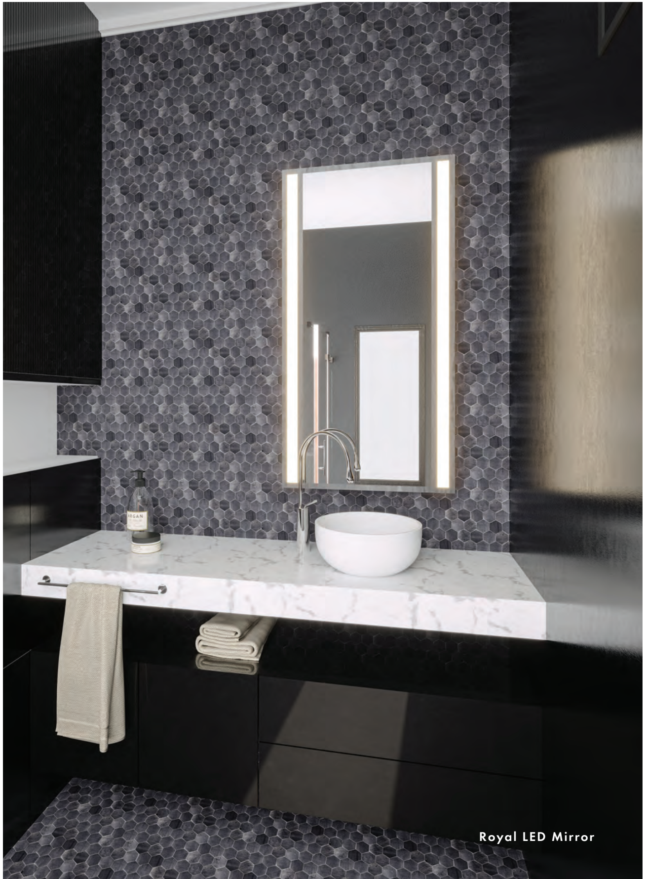
Royal LED Mirror