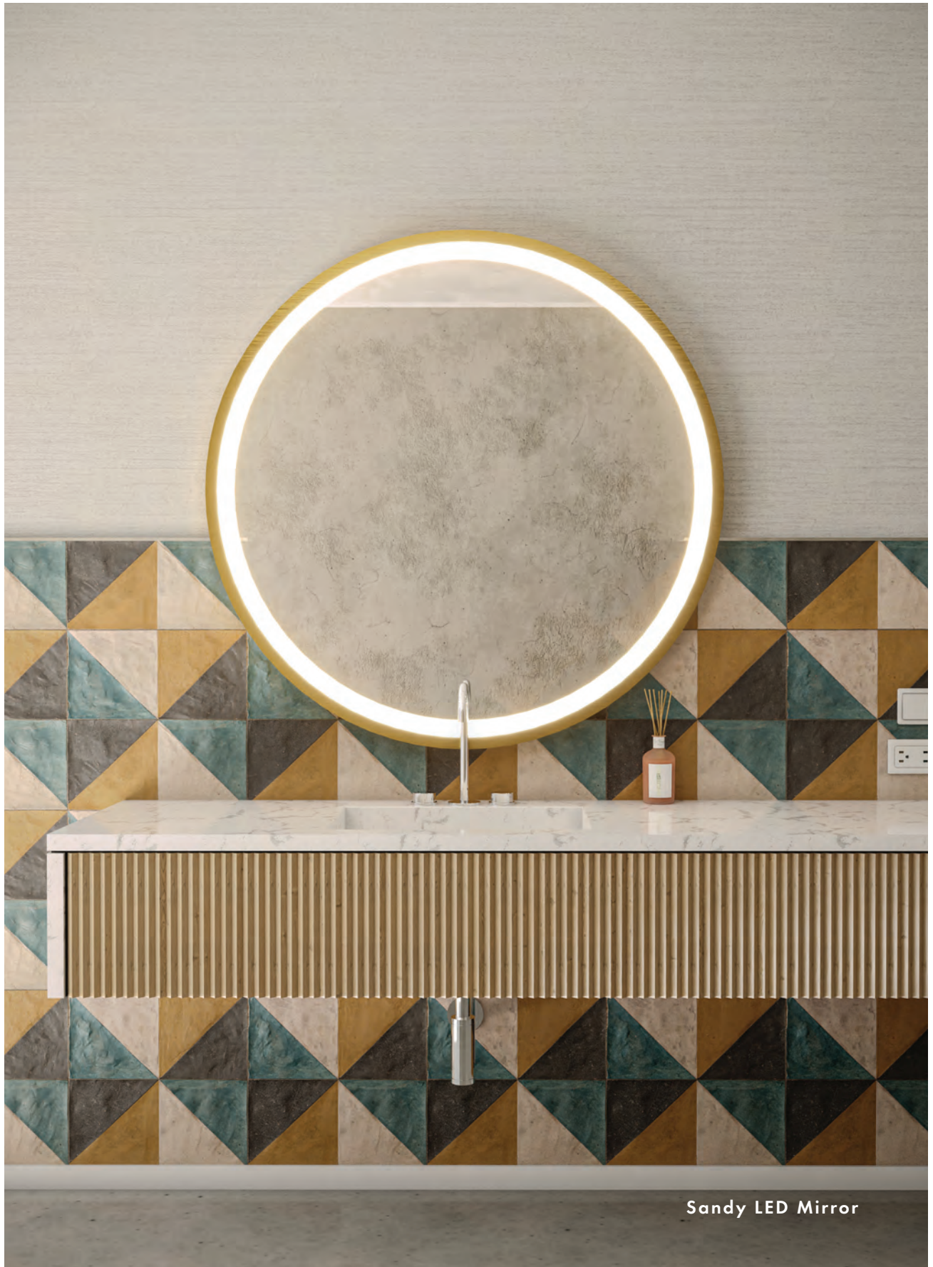
Sandy LED Mirror