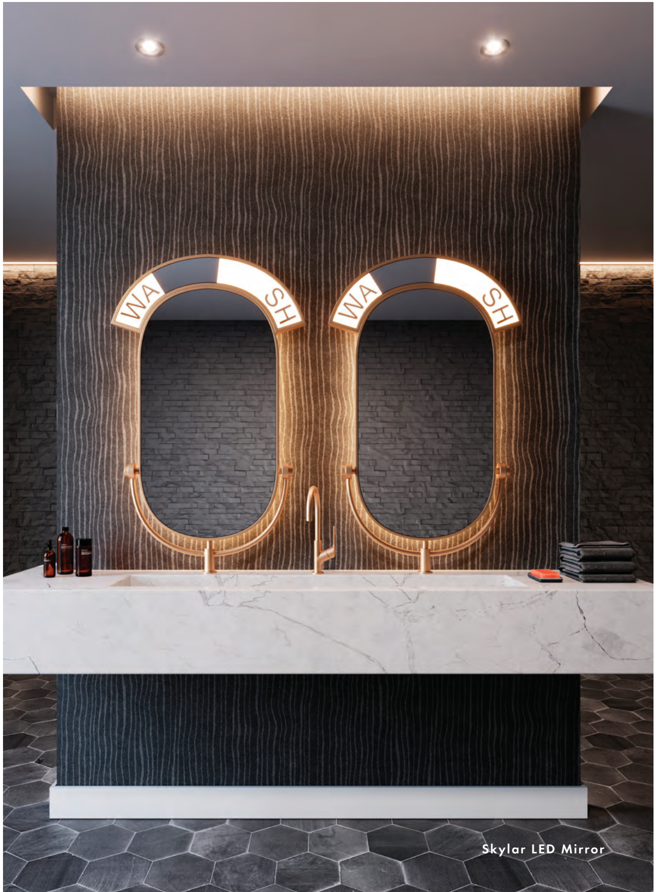
Skylar LED Mirror