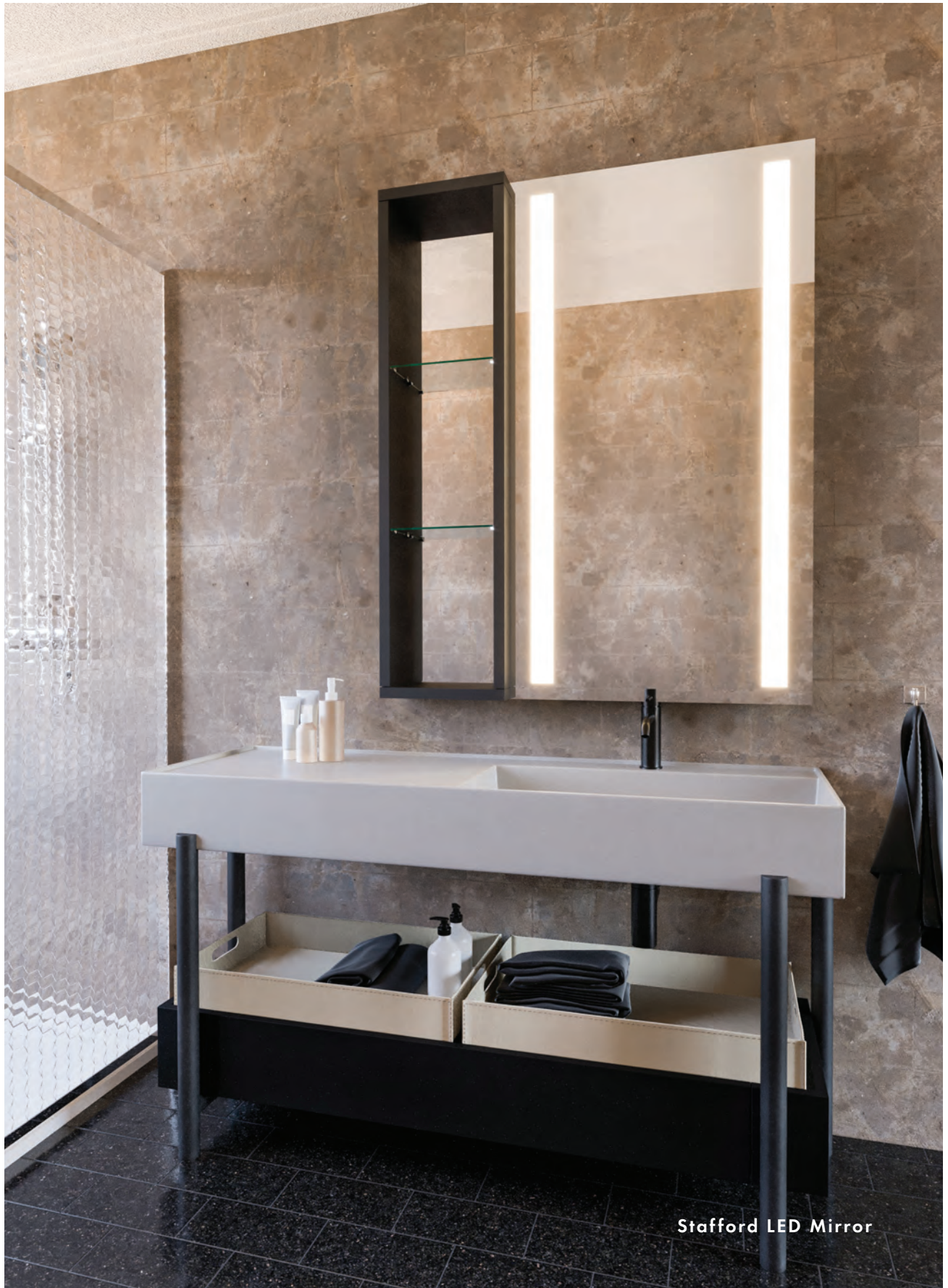
Stafford LED Mirror