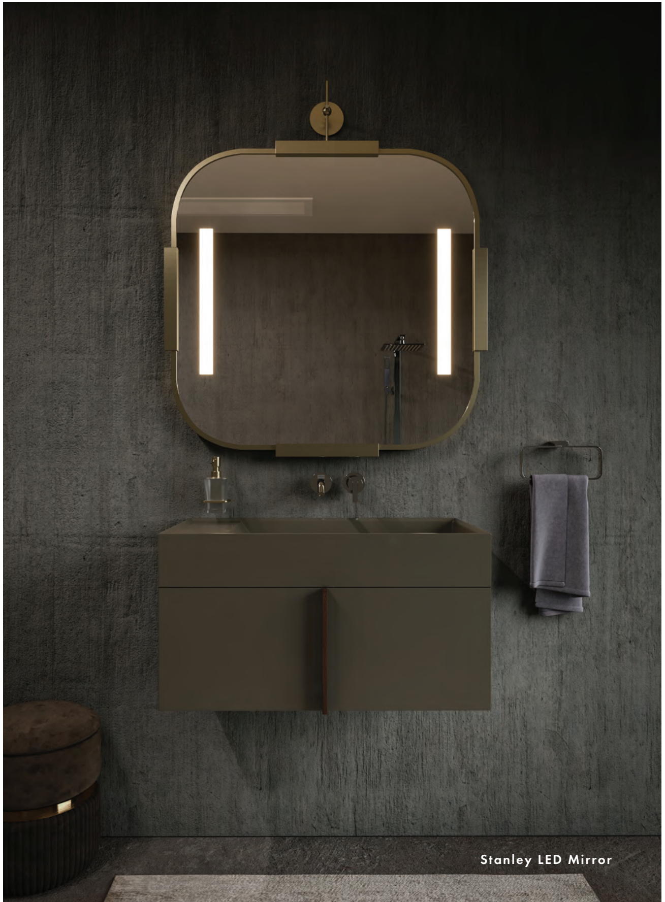
Stanley LED Mirror