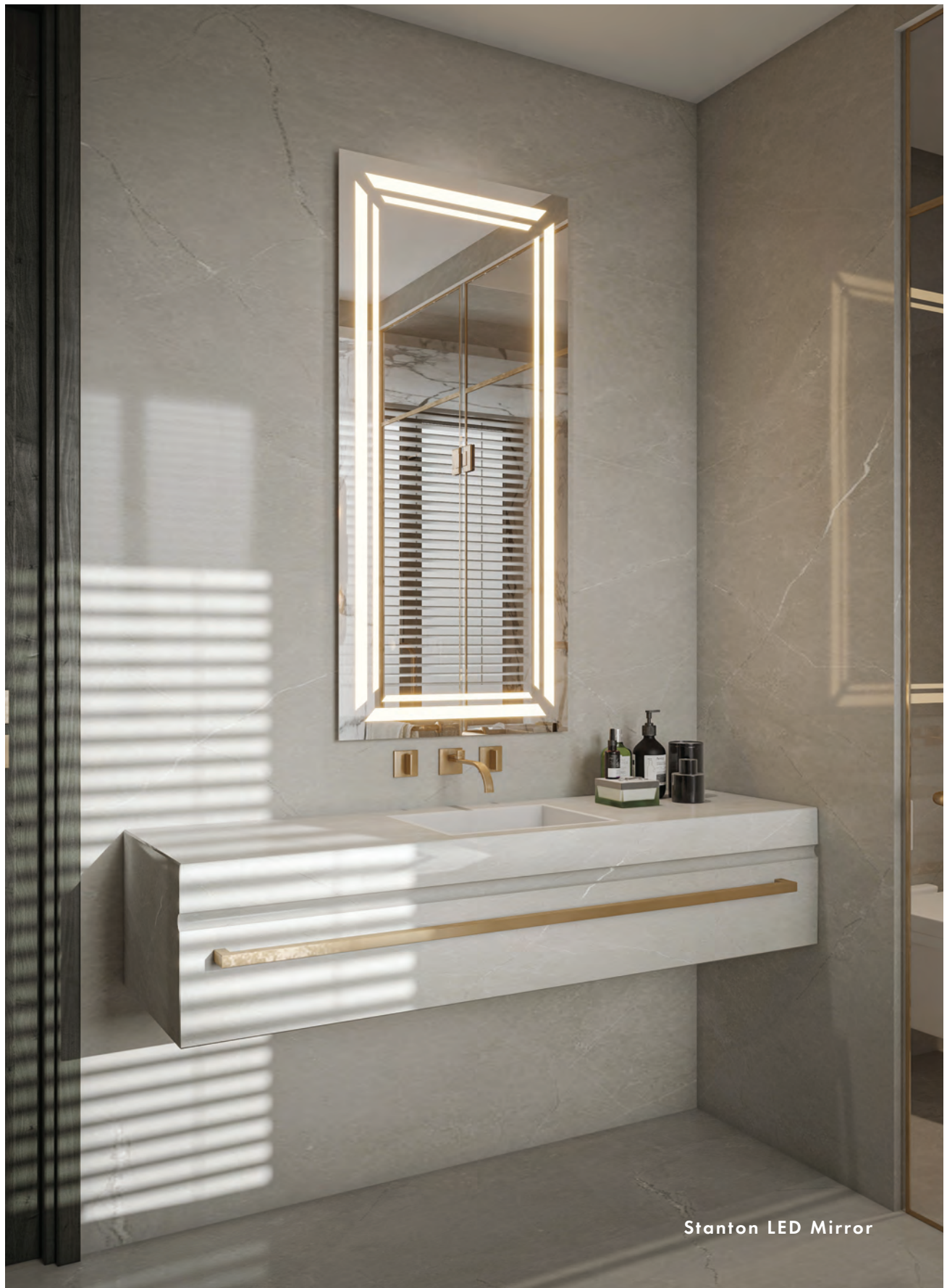
Stanton LED Mirror