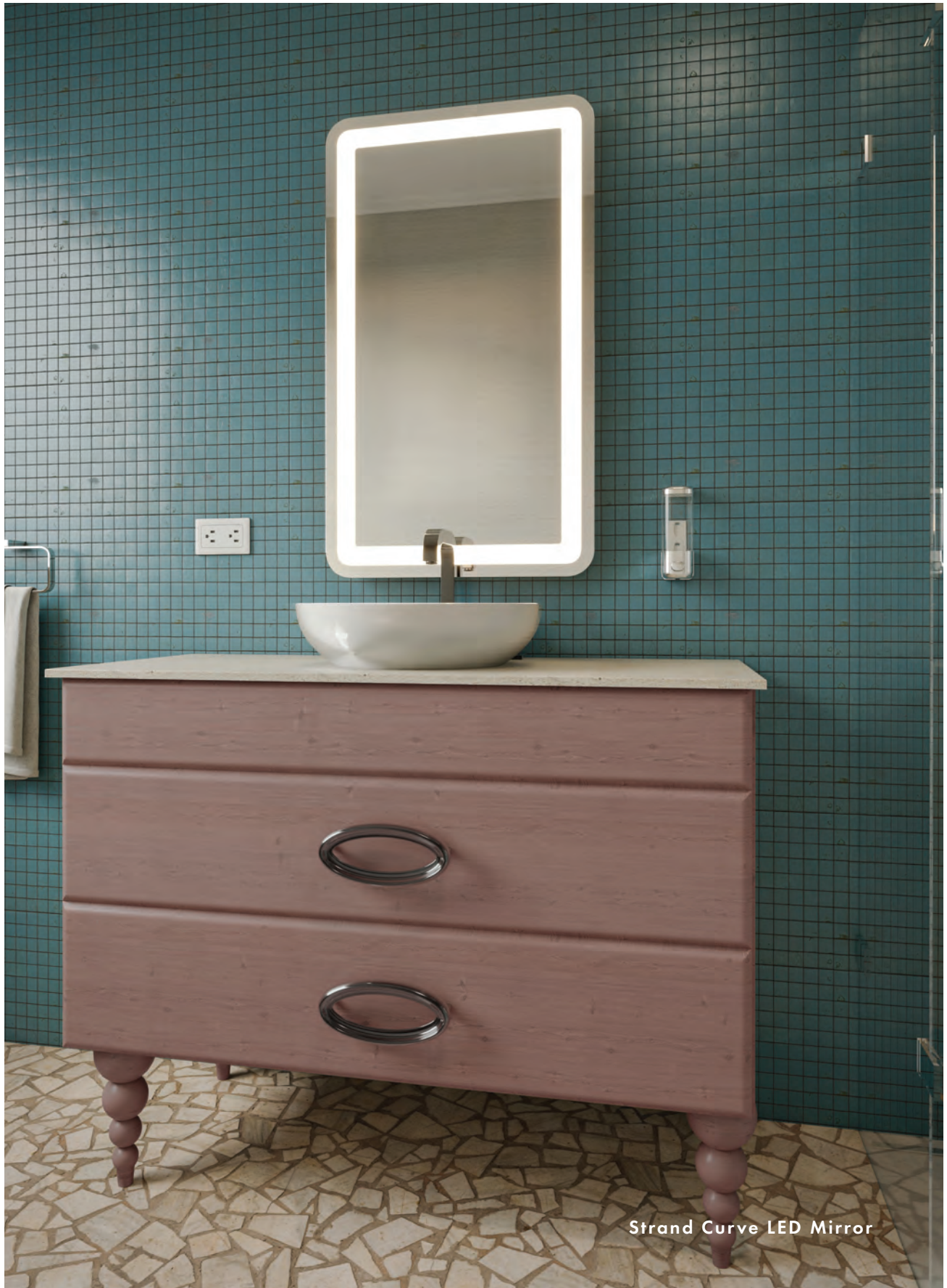
Strand Curve LED Mirror