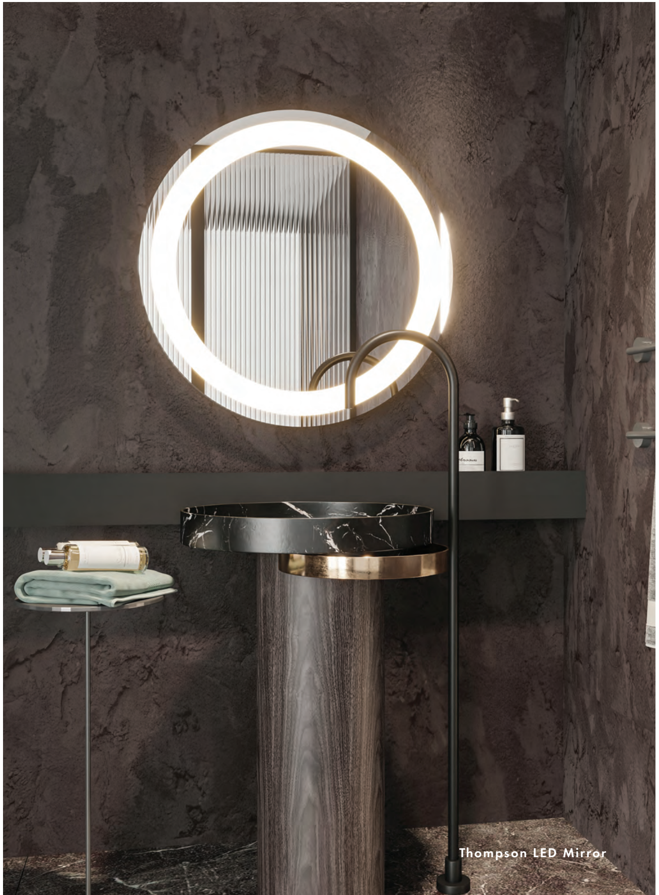
Thompson LED Mirror