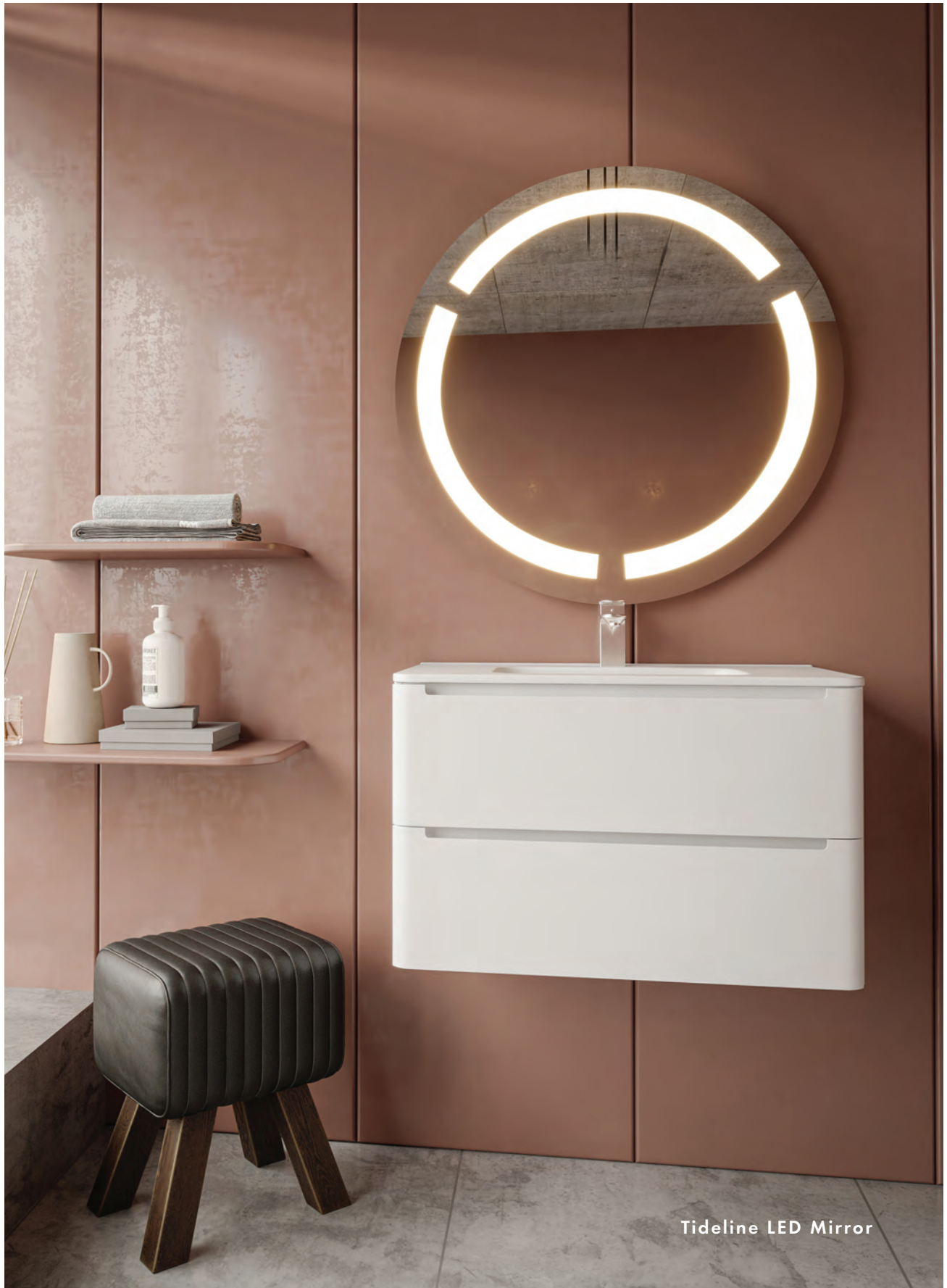
Tideline LED Mirror